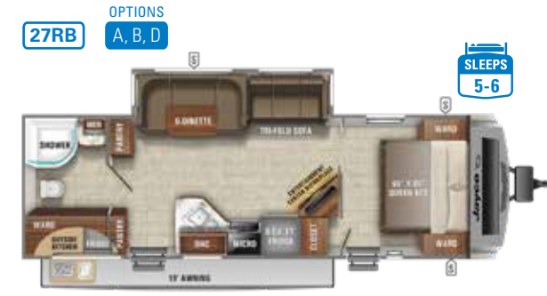
Ext. Lgth: 32' 10" Weight: 6,850 lbs. Hitch: 750 lbs.