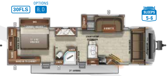
Ext. Lgth: 37' 0" Weight: 7,740 lbs. Hitch: 1,020 lbs.