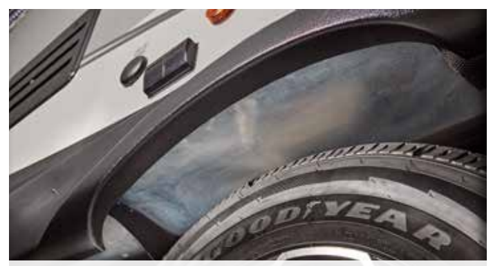
Galvanized Steel, Impact-Resistant Wheel Wells