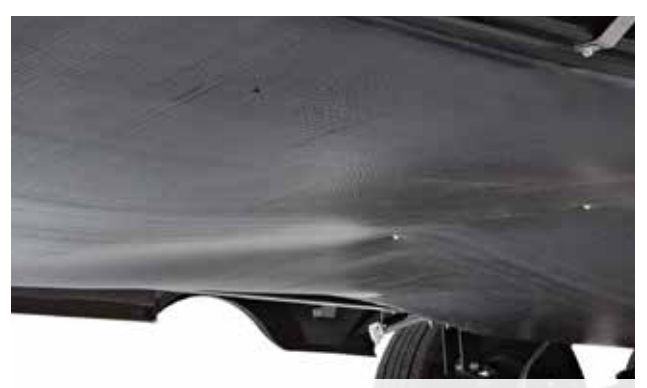
Enclosed Underbelly with New Climate Shield