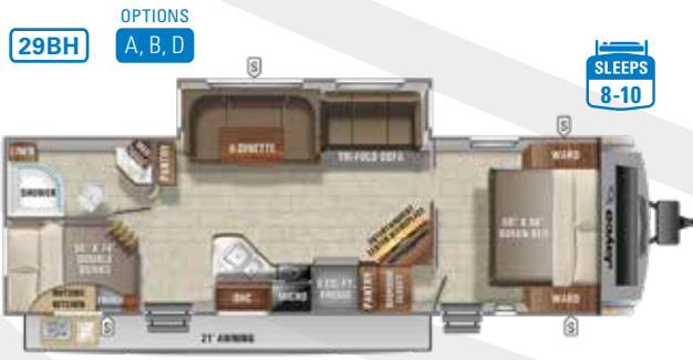
Ext. Lgth: 34' 9" Weight: 7,180 lbs. Hitch: 830 lbs.

Ext. Lgth: 33' 6" Weight: 6,805 lbs. Hitch: 785 lbs.