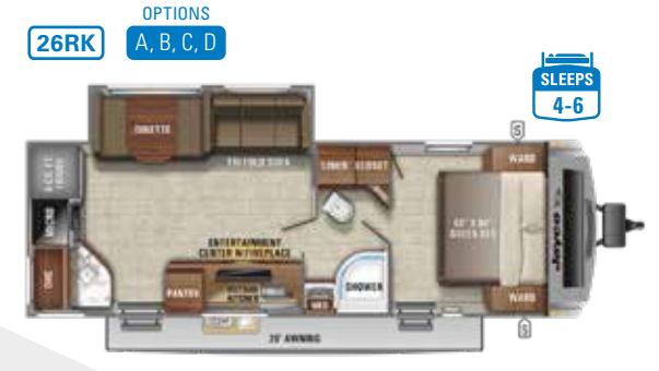
Ext. Lgth: 31' 6" Weight: 6,585 lbs. Hitch: 775 lbs.

Ext. Lgth: 29' 5" Weight: 6,140 lbs. Hitch: 735 lbs.