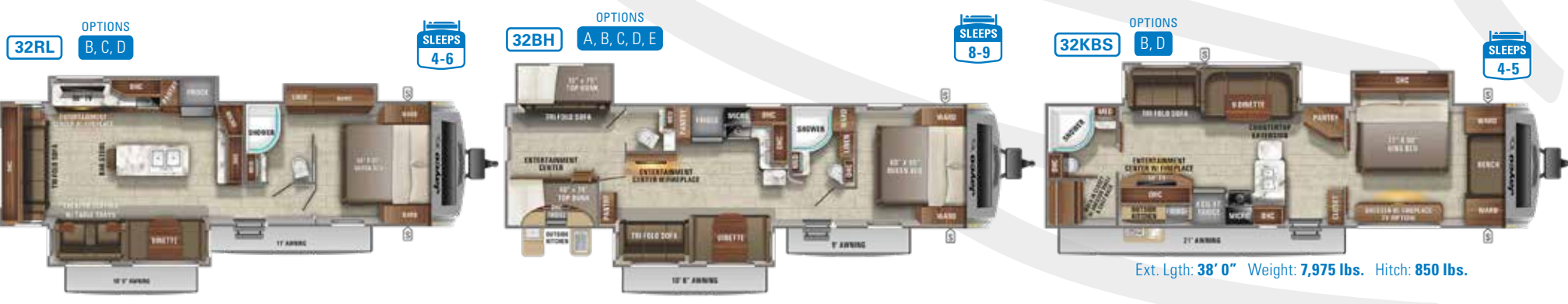
Ext. Lgth: 36' 10" Weight: 7,900 lbs. Hitch: 910 lbs.

Ext. Lgth: 38' 0" Weight: 8,145 lbs. Hitch: 1,125 lbs.