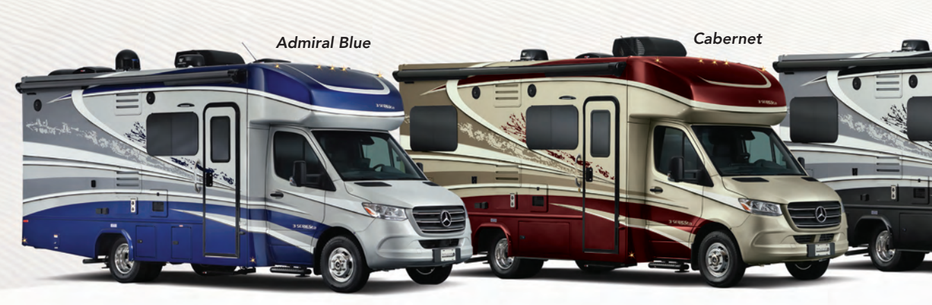
FULL BODY PAINT PACKAGES With Front-End Diamond Shield

* UVW is an estimate only based on standard equipment