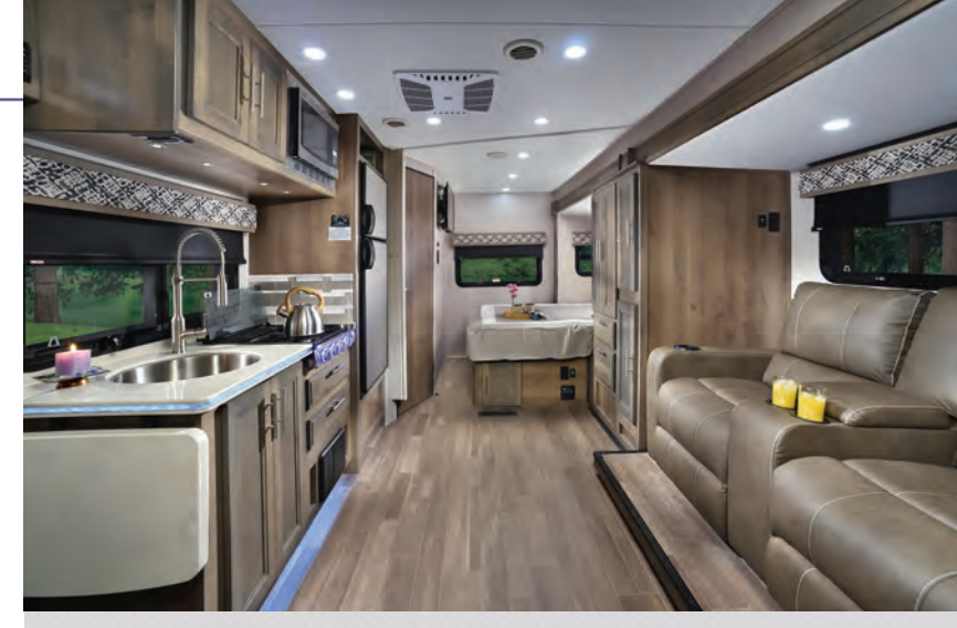
24FW shown with Driftwood cabinetry, Walnut décor and optional Dual Recliners.