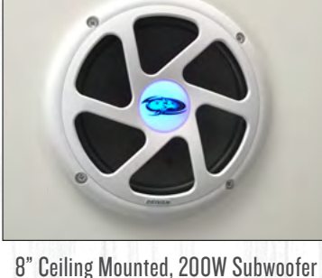
8" Ceiling Mounted, 200W Subwoofer with Accent Lighting