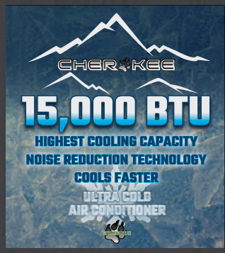
Supersized, Central Air Conditioning Unit (15,000 BTU) with Quick Cool Air Dump Feature