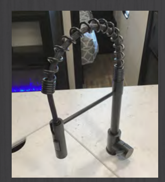
Matte Black Heavy Duty Spring Assisted Kitchen Faucet Sprayer