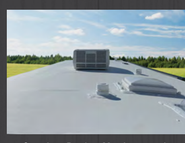
Seamless Roofing Membrane with Heat Reflectivity

Light Filtering Sheer Shading Premium Black Out Zebra Blinds