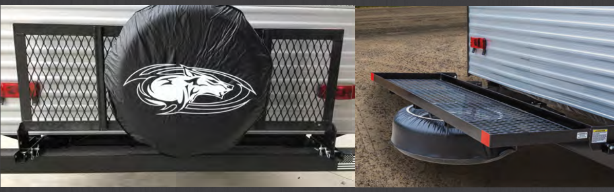
Flip Down Travel Rack (not available on Toyhauler Models)