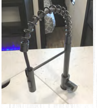
Matte Black Heavy Duty Spring Assisted Kitchen Faucet Sprayer