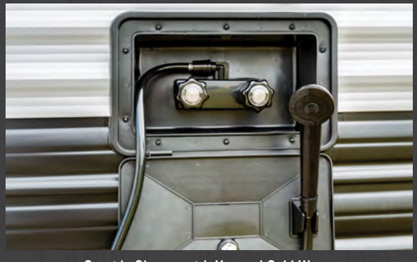
Outside Shower with Hot and Cold Water