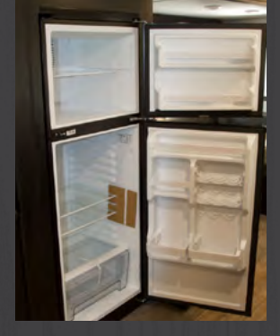
Cannon™ I2V, High Efficiency, II Cubic Foot Residential Refrigerator with Travel Lock