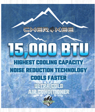
Supersized, Central Air Conditioning Unit (15,000 BTU) with Quick Cool Air Dump Feature