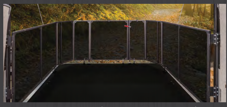
Ramp Door Patio System (Available on Toyhauler Models Only)