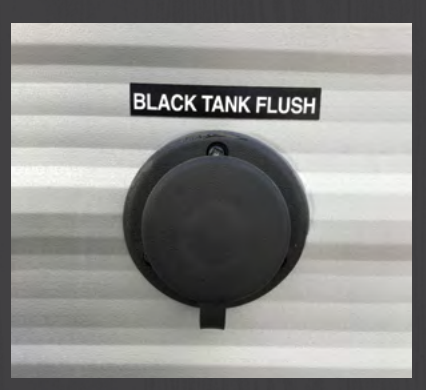
Black Tank Waste Flush Out Kit