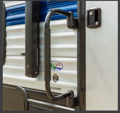
Large Exterior Folding Assist Grab Handle