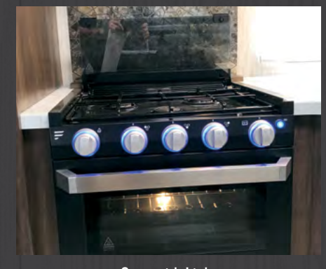
Oven with Light