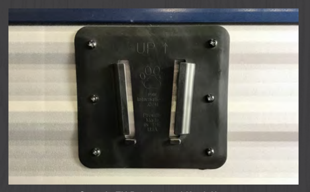
Outside TV Bracket and Hook Ups