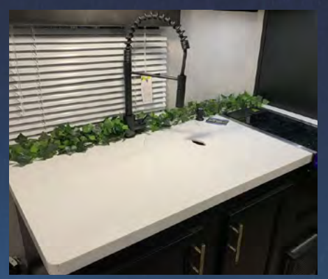
LG Solid Surface Countertop