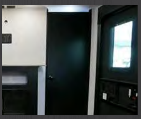
Solid Bedroom Doors (not available on all models)