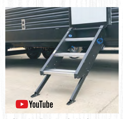
Cherokee Exclusive Stable Step with Oversized Landing, 600LB. Capacity, Quick Release and Kick Plate