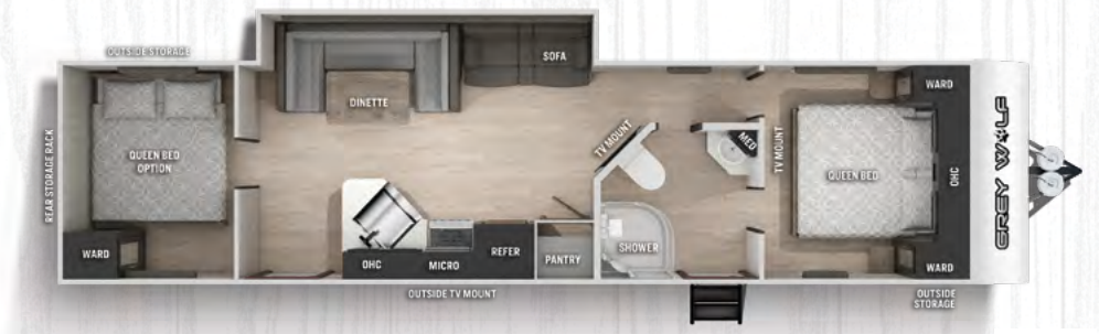
CLICK OR SCAN FOR FLOORPLAN SHEET