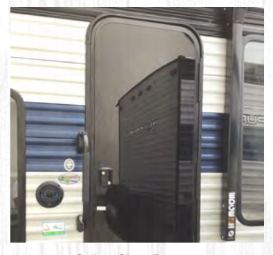
Safety Slam Friction Hinge Entrance Door