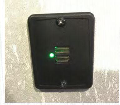
USB Charging Stations (Beds, Bunks, Tables where applicable)