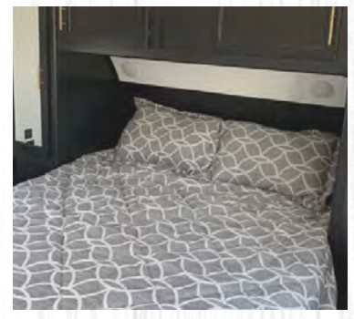
Premium Bedding Ensemble and Comforter