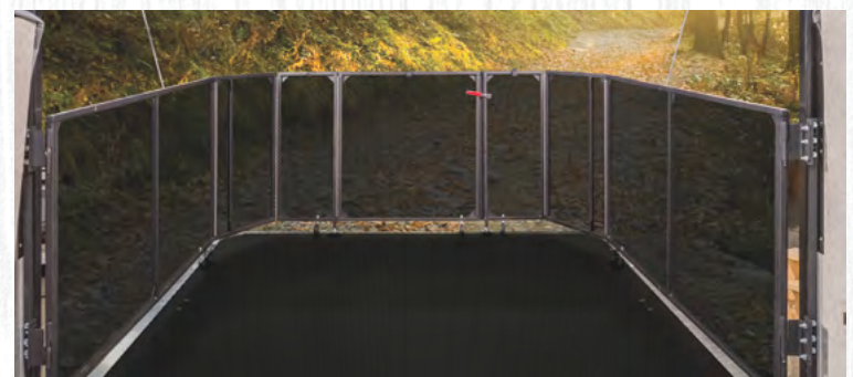
Ramp Door Patio System (Available on Toyhauler Models Only)