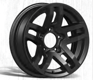
Premium Wheel Package