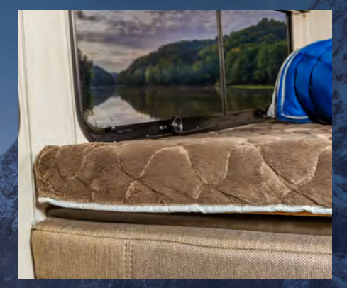
Oversized Bunk Pads