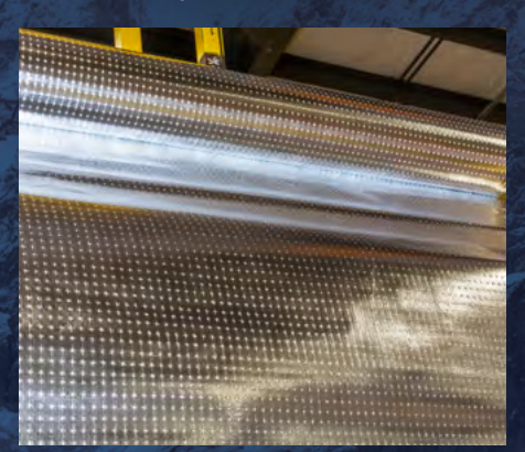
Thermo-Foil Arctic Insulation