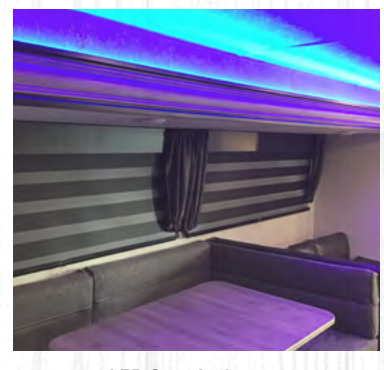
LED Strip Lighting (Not available on all models)