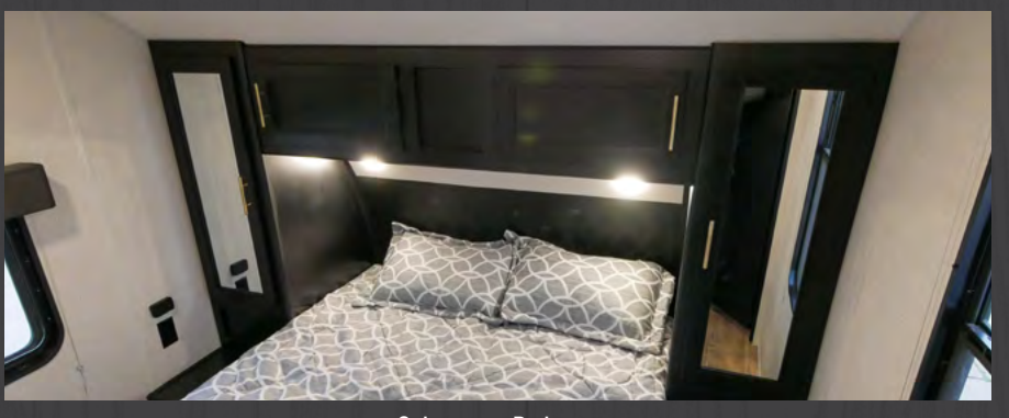
Cabinets in Bedroom