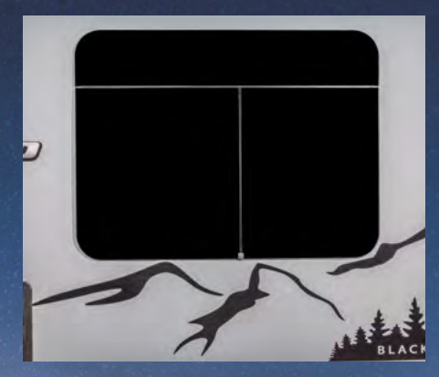
Automotive Frameless Windows Package