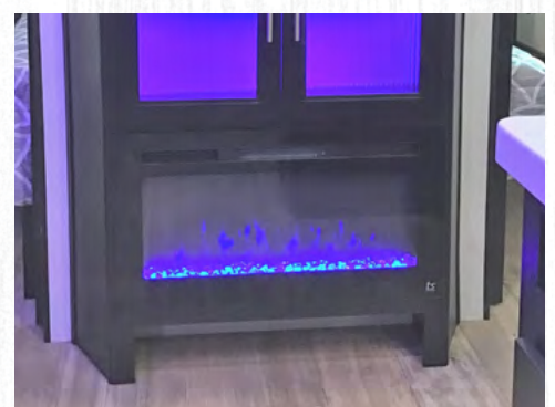
Fireplace (Not available on all models)