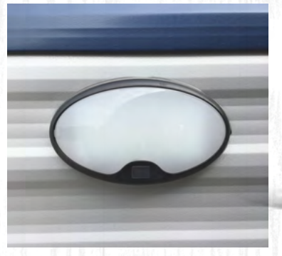
External Porch Scare Light