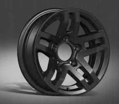
Premium Wheel Package