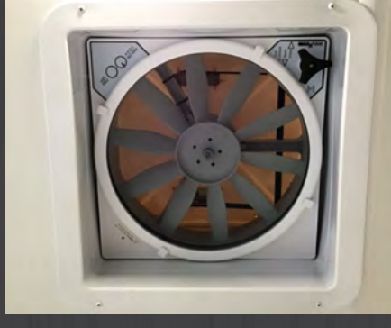
High Output Attic Fan in Bathroom