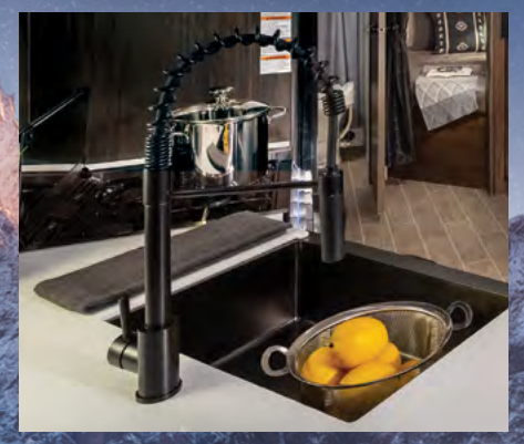
Residential Pullout Faucet