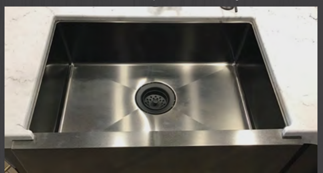
Residential Farm Style Black Stainless Steel Sink