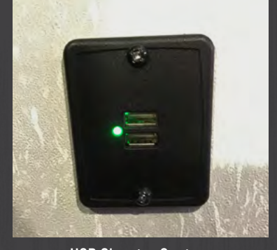
USB Charging Stations (Beds, Bunks, Tables where applicable)