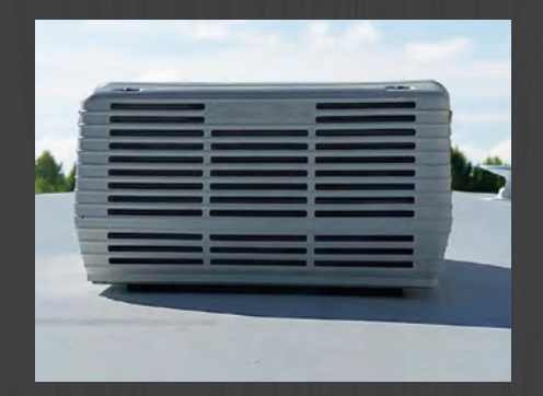
Roof Mounted Ducted Air Conditioner (Not available on units under 26')