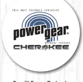
Power Gear™ Frame Technology and Space Saver Rail Design