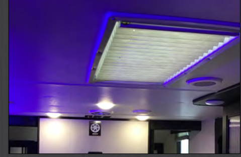
Kitchen Skylight W/ Shade (N/A on FW)