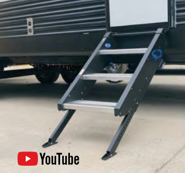
Cherokee Exclusive Stable Step with Oversized Landing, 600LB. Capacity, Quick Release and Kick Plate