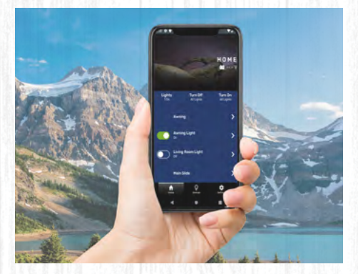
Cherokee Total Control App & Remote Control System