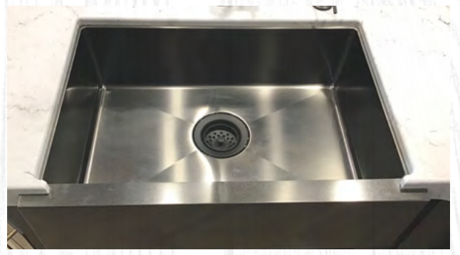
Residential Farm Style Black Stainless Steel Sink