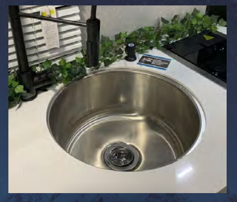
Deep Stainless Steel Sink