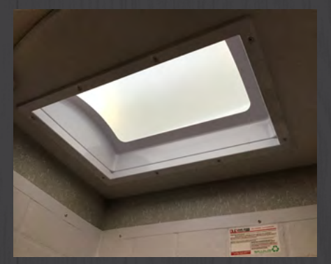
Skylight over Shower