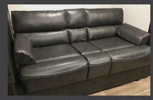
Upgraded Sofa with Bolster Arm Rests