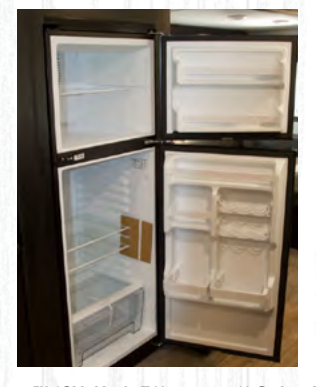
Cannon™ 12V, High Efficiency, II Cubic Foot Residential Refrigerator with Travel Lock