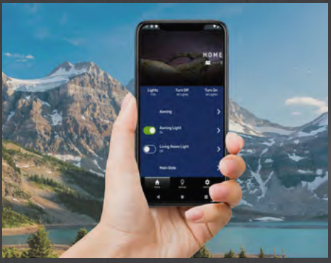
Cherokee Total Control App & Remote Control System