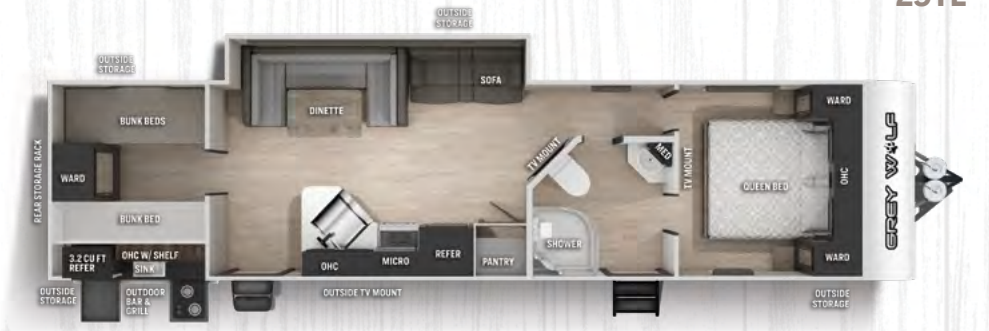
CLICK OR SCAN FOR FLOORPLAN SHEET