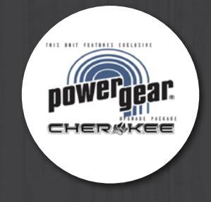
Power Gear™ Frame Technology and Space Saver Rail Design