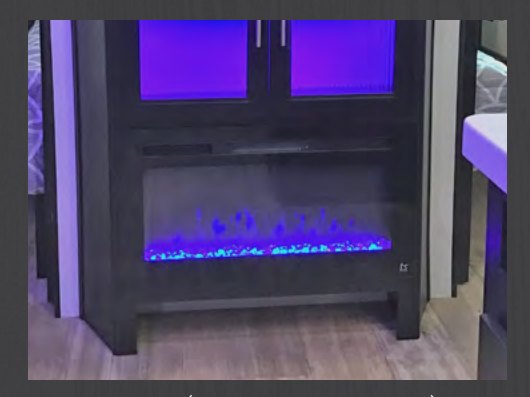
Fireplace (Not available on all models)