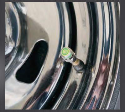
Tire Pressure Monitors