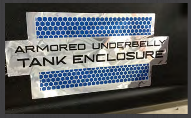
Armored Underbelly Tank Enclosure