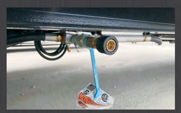
RV Grill Quick Connect