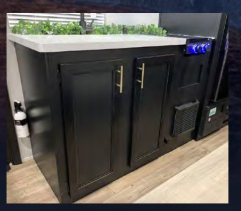
Solid Wood Cabinet Doors