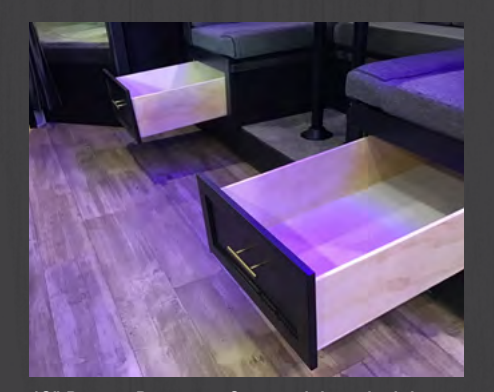
40" Dinette Drawers x 2 on models with slideouts

' Optional package. Not all items available on all models. See participating dealers for details