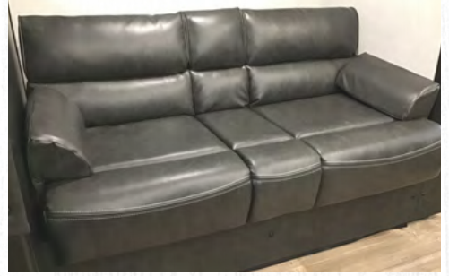
Upgraded Sofa with Bolster Arm Rests