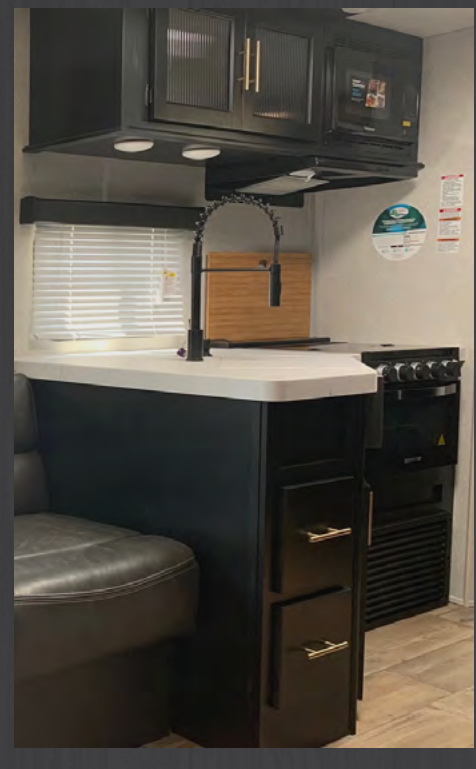
Chef Select Black Stainless Steel Kitchen Suite Package