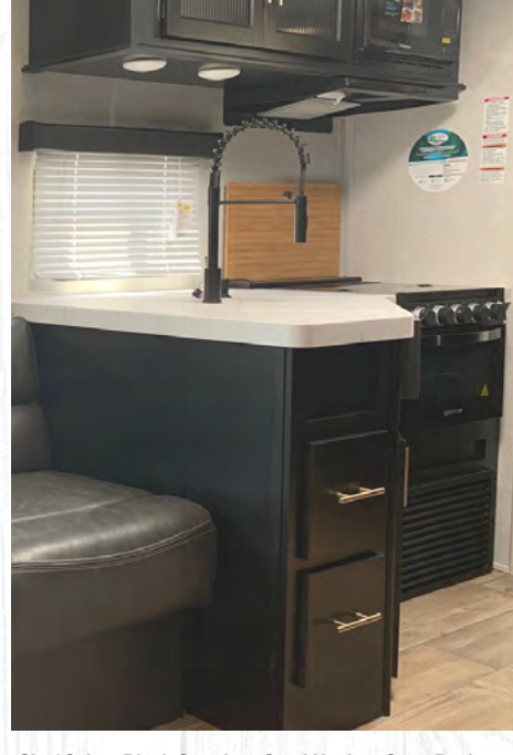
Chef Select Black Stainless Steel Kitchen Suite Package