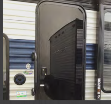
Safety Slam Friction Hinge Entrance Door