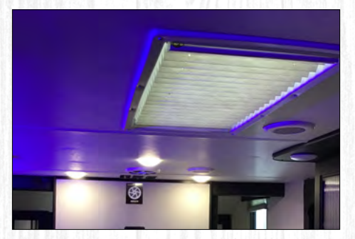
Kitchen Skylight W/ Shade (N/A on FW)