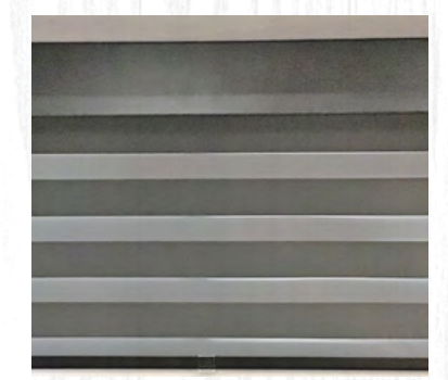
Light Filtering Sheer Shading Premium Black Out Zebra Blinds