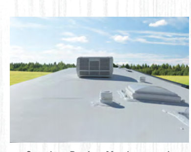
Seamless Roofing Membrane with Heat Reflectivity