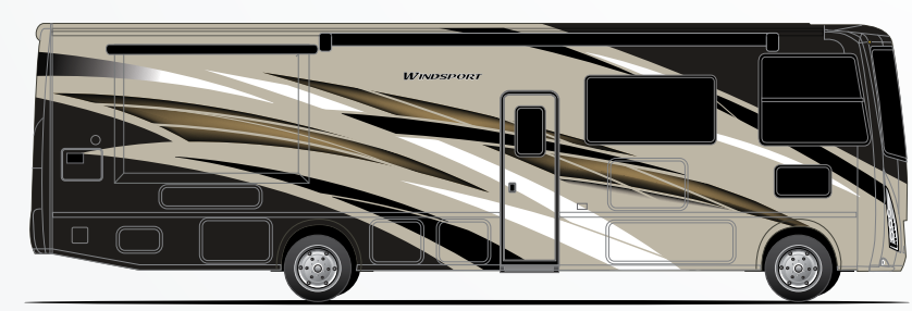
SEVILLE PARTIAL PAINT