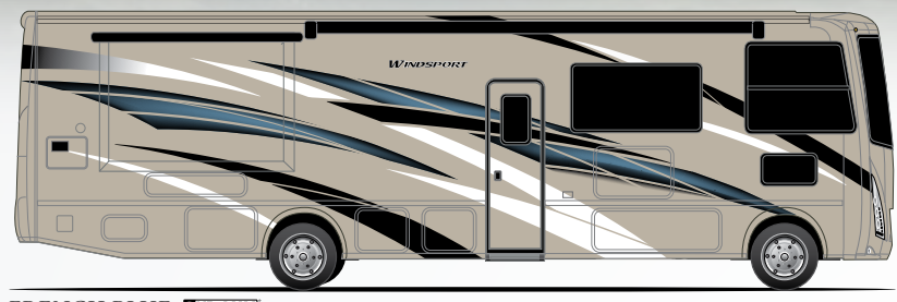
FRENCH BLUE THO-MAX