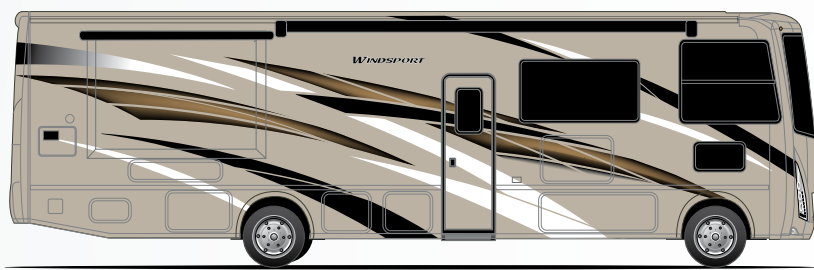
SPANISH GOLD THO-MAX