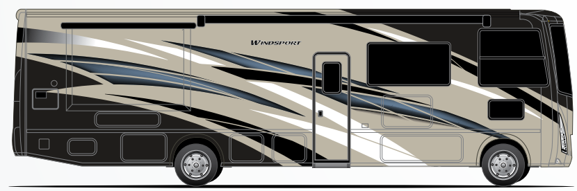
PARIS NIGHT PARTIAL PAINT