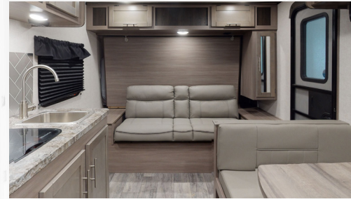
186BH Murphy Bed