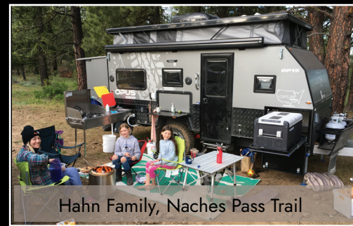
Hahn Family, Naches Pass Trail