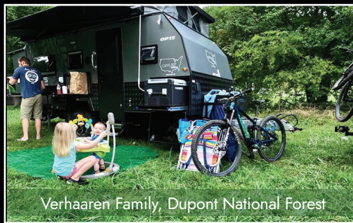
Verhaaren Family, Dupont National Forest