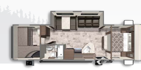
COLORADO 29BHC Length: 33' 3" Weight: 6,458 lbs. Sleeps: 7-9 Hitch: 818 lbs. Height: 11'3"

*All information & specifications are for units manufactured after 01/01/2021