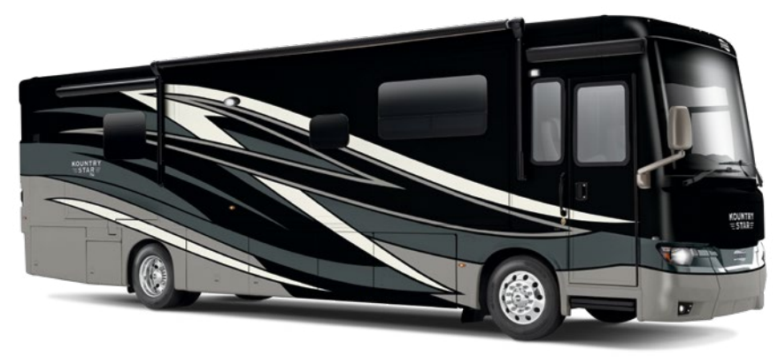
URBAN EXTERIOR Awning Color: Charcoal Tweed