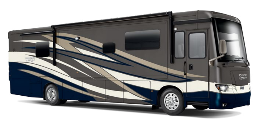
FOUNDRY EXTERIOR Awning Color: Charcoal Tweed