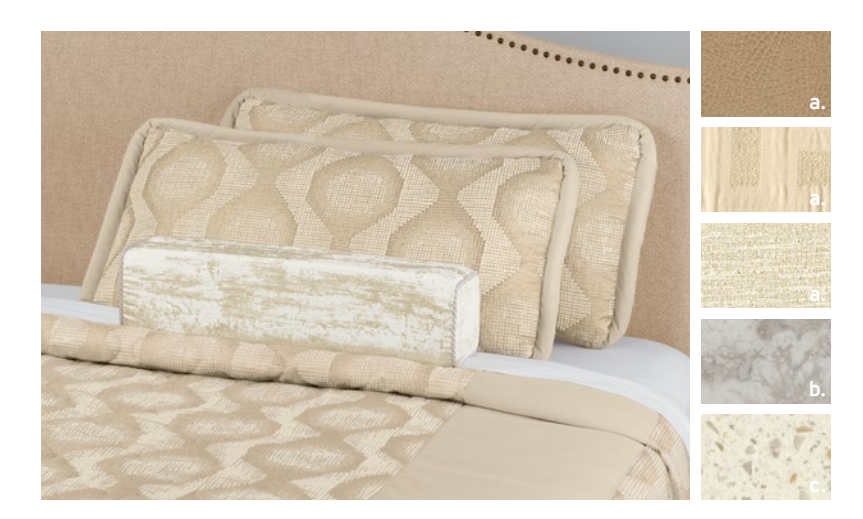
FOUNDRY INTERIOR a. Furniture/Fabric b. Flooring c. Counter Top