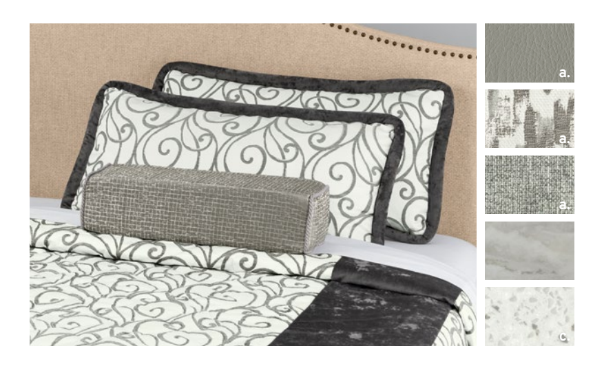
URBAN INTERIOR a. Furniture/Fabric b. Flooring c. Counter Top