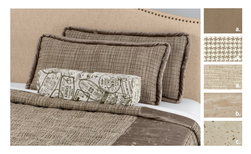
ASHBURY INTERIOR a. Furniture/Fabric b. Flooring c. Counter Top

ASHBURY EXTERIOR Awning Color: Linen Tweed