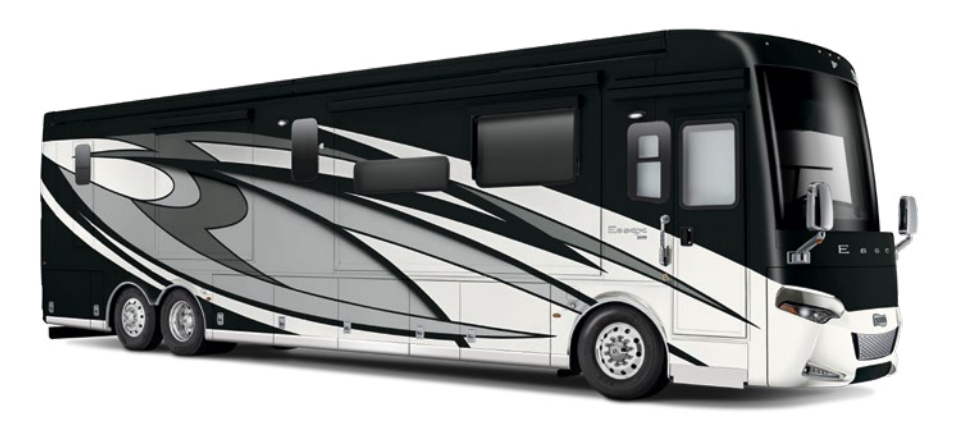
WINDHAM EXTERIOR Awning Color: Charcoal Tweed

WINCHESTER EXTERIOR Awning Color: Charcoal Tweed