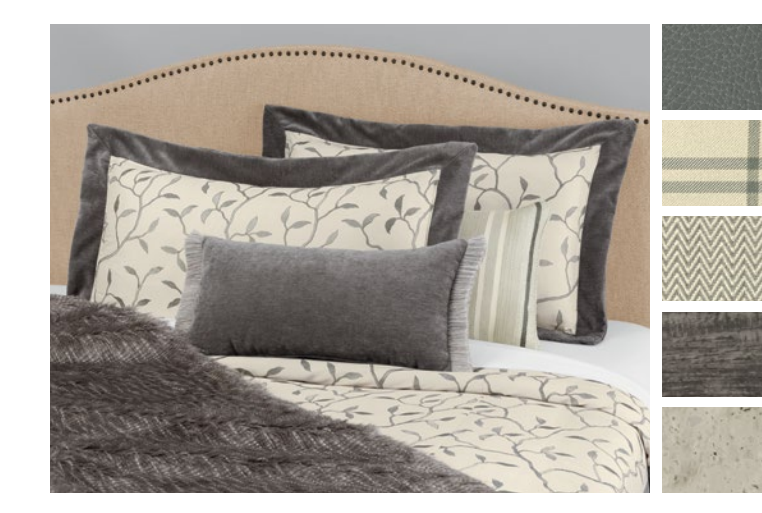
WINDHAM INTERIOR a. Furniture/Fabric b. Flooring c. Counter Top