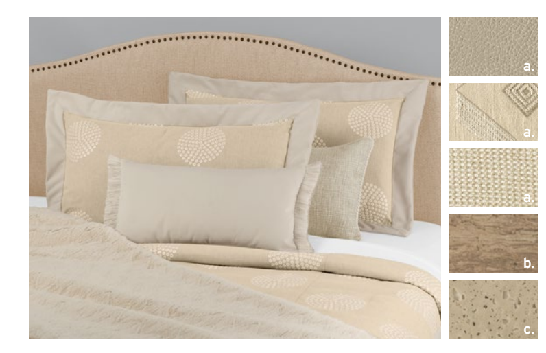
DUTTON INTERIOR a. Furniture/Fabric b. Flooring c. Counter Top