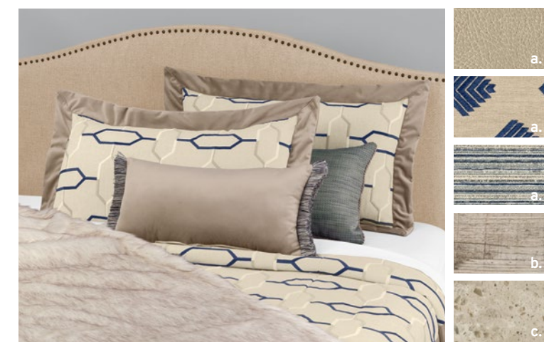
WINCHESTER INTERIOR a. Furniture/Fabric b. Flooring c. Counter Top