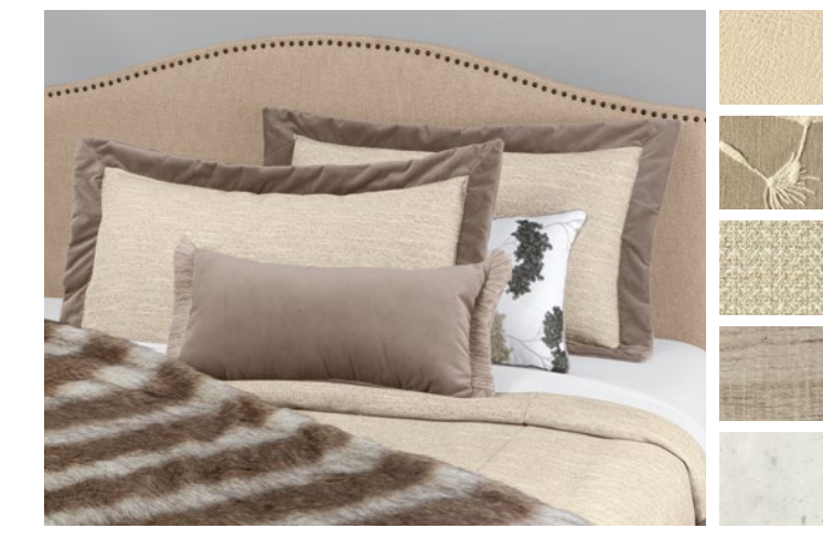
TROVE INTERIOR a. Furniture/Fabric b. Flooring c. Counter Top