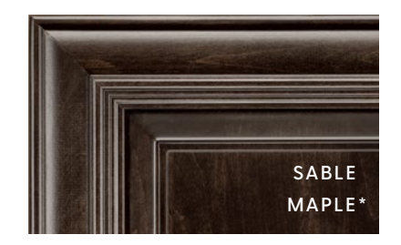
*Available in High Gloss or Matte Finish