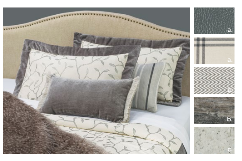
a. Furniture/Fabric b. Flooring c. Counter Top