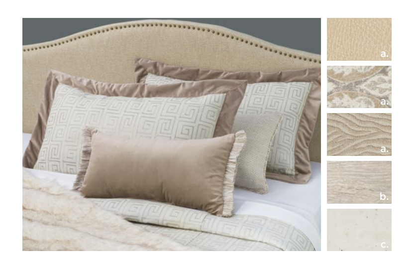
CAMBRIDGE INTERIOR a. Furniture/Fabric b. Flooring c. Counter Top