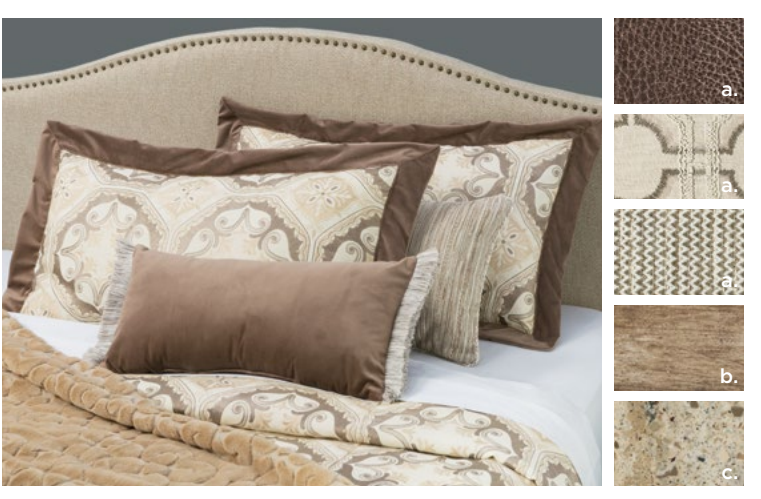
RIALTO INTERIOR a. Furniture/Fabric b. Flooring c. Counter Top