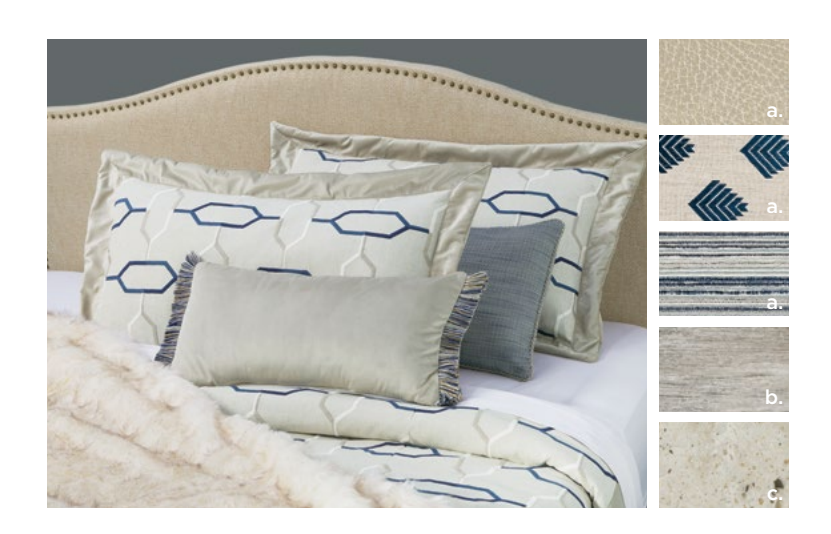
WINCHESTER INTERIOR a. Furniture/Fabric b. Flooring c. Counter Top