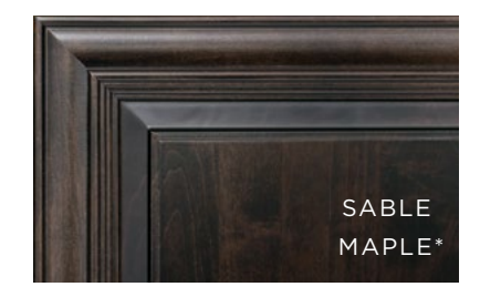
*Available in High Gloss or Matte Finish