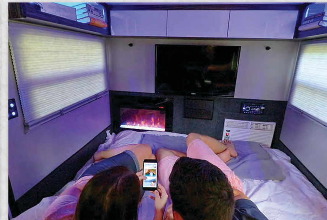
Large Sleeping Space