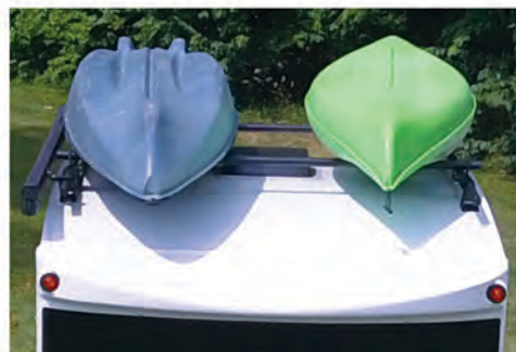
Rover Roof Rack