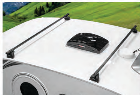
Thule Roof Rack