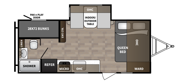
KODIAK CUB 198BH Length: 23' 8" Weight: 4,000lbs Sleeps: 5-6 Height: 10'5" Hitch: 469lbs

*All information & specifications are for units manufactured after 09/15/2019