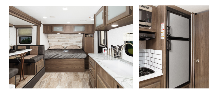
Standard Features In Every Floor Plan