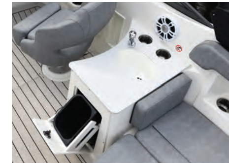
Freshwater Sink, Counter Top Area, and Removable Trashcan (231DC shown)