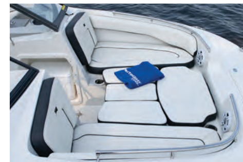
Bow Filler Cushions - Option #84 (201DS shown)