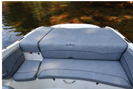
Walk-Thru Removable Filler Cushion (Option #47 or #77)