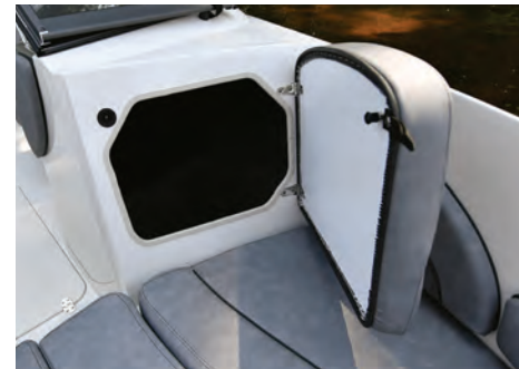
Hidden Seat Storage - varies by model (198LX shown)