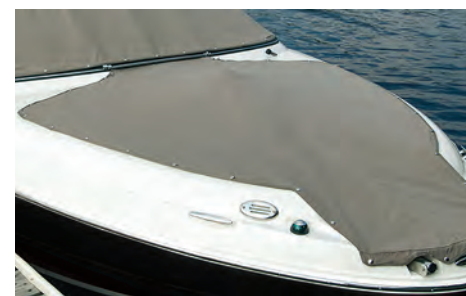
Bow Cover (shown in standard latte) - Option #18