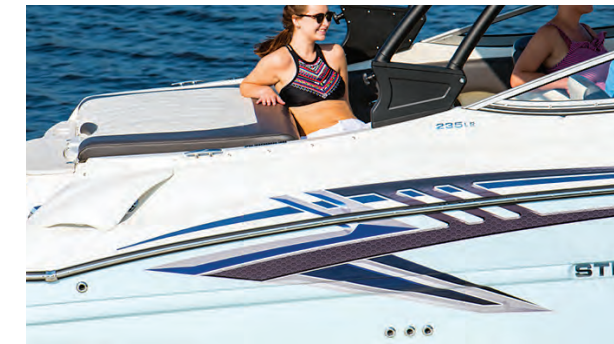
Hyper Graphic (Blue) - Option #346 (2019 Interior shown)