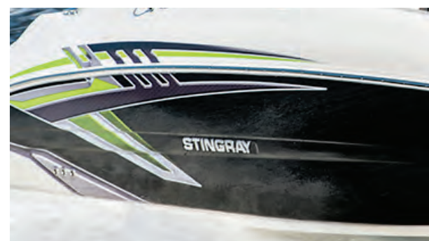
Hyper Graphic (Green) - Option #351