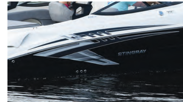
Hyper Graphic (Gray) - Option #347