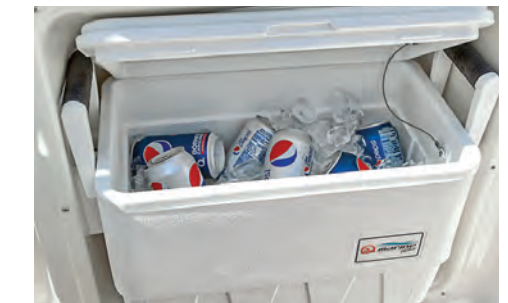
25-quart Removable Cooler