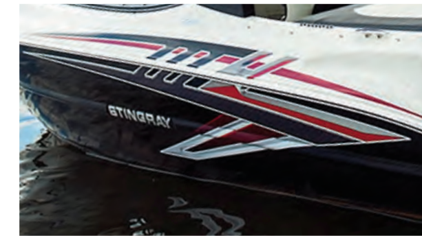
Hyper Graphic (Red) - Option #349