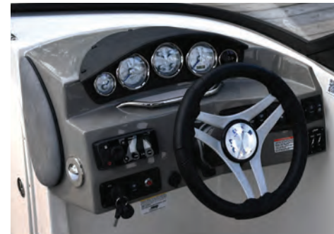
Custom Steering Wheel (style varies by model)