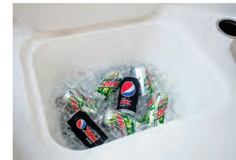
Bow Ice Chest (sizes and styles vary)