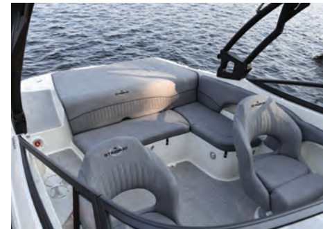
Gray Vinyl Interior