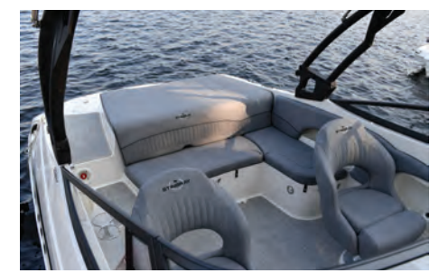
Sport Deck Interior (sterndrive) - Bucket Seats, Wrap-around Seating, & Sundeck (235LR)