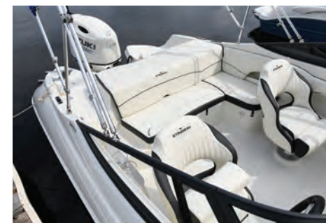
Ivory and Onyx CoolTouch™ Vinyl Interior (no charge choice)