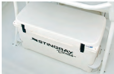
74-quart Engel Cooler (Standard for 216CC and 236CC)