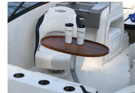
Cockpit Table with Floor Mount & Teak Table Upgrade Options #76 & #94 (201DS shown)