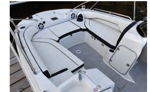
Deck Boat Interior - Sport Bucket, Open Layout, and Lots of Seating (192SC shown)