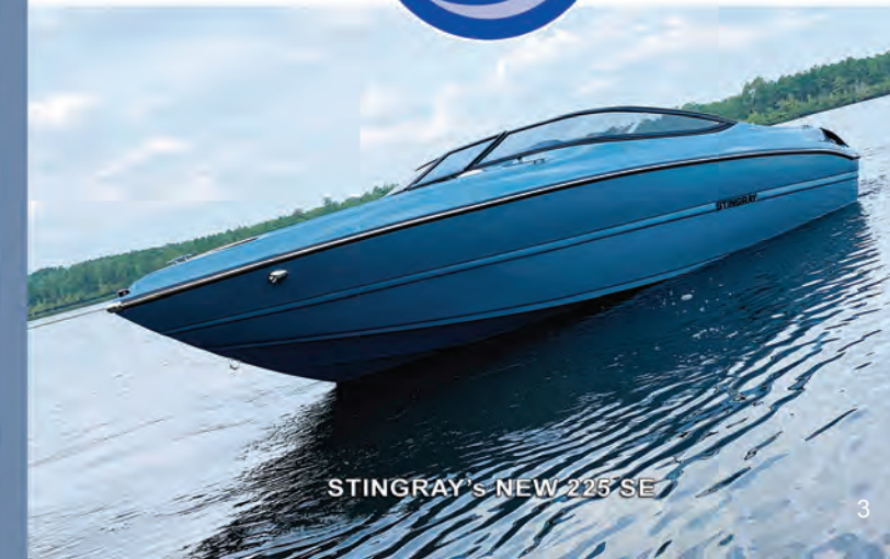
STINGRAY's NEW 225 SE