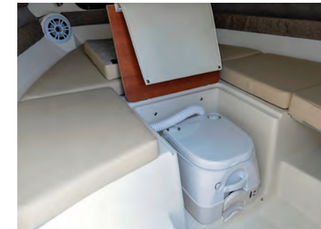
Molded Fiberglass Cabin Liner with Storage, Butane Stove, and Porta Potti (225CR shown)