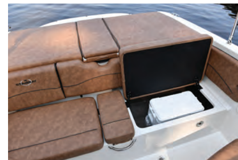
Brown Vinyl Interior - Also featuring hidden storage