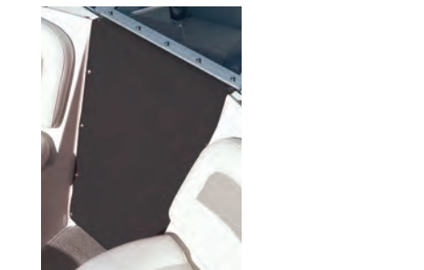
Walk-Thru Flap (shown in optional black) - Option #14