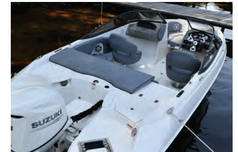
Sport Deck Interior (outboard) - Bucket Seats, Wrap-around Seating, & Sundeck (204LR shown)