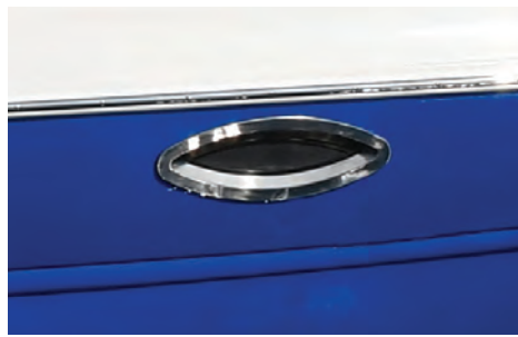
Stainless Steel Port Windows