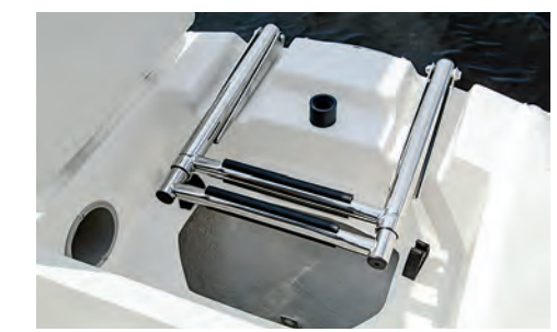
Slide-out Bow Ladder, Fender Storage, and Anchor Storage (Sport Deck Models)