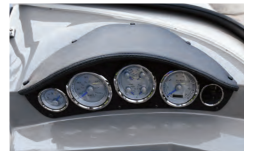
Custom Dash with Backlit Instruments and Stainless Steel Accents