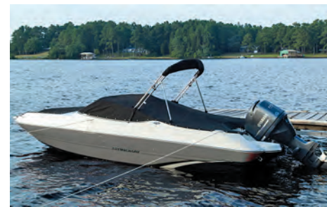
Cockpit and Bow Cover (shown in optional black) - Option #17