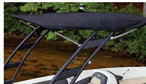
Wakeboard Tower Top (shown in optional black) - comes with Option #663