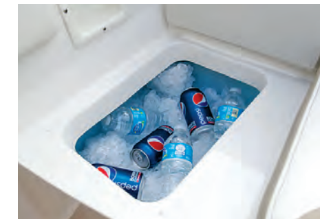
Ice Chest Under Walk-Thru Step (varies by model)