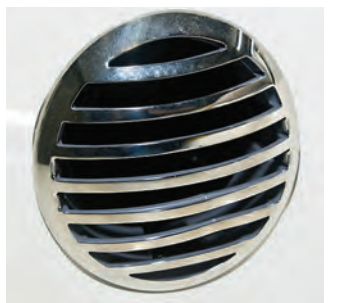
Stainless Steel Hardware Package (Option #820) Items vary by model. Refer to page 46 for complete package details.