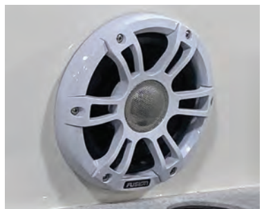
Fusion Audio Systems (Options #727, #732, #728, & #729)