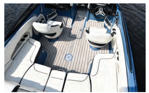
Sport Boat Interior (225SE shown) - Bucket Seats, Wrap-around Seating, & Center Walk-Thru Sundeck (225SE shown)