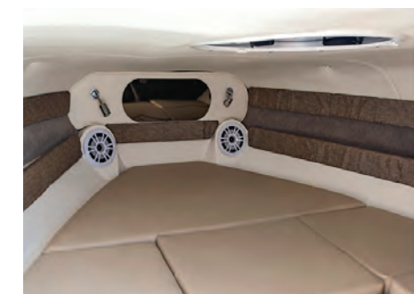
Interior Cuddy Cabin (225CR shown)