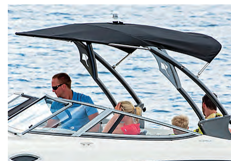
Tower (Folding Arch Style) and Top (Option #663)