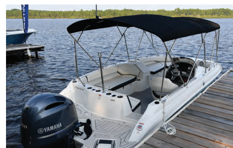
Stand-up Forward Bimini Top (shown in optional black) - Option #64 - attaches to front of the standard deck boat Stand-up Bimini Top (192SC shown)