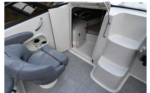
Integrated Bow Steps and Lockable Cabin Door (225CR shown)