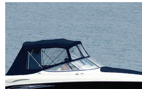
Full Canvas Set (shown in optional black) - Option #4