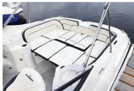
Cockpit Filler Cushions - 250LR (shown) and 250CR