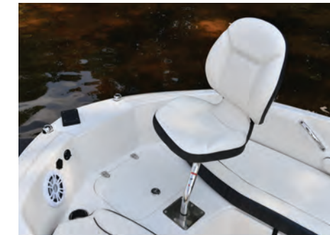
Fishing Package (Option #802) items vary by model. Refer to page 46 for complete package details.