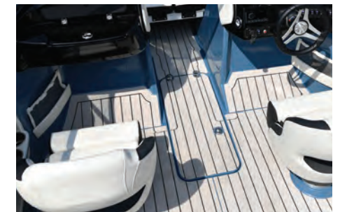
Floor Storage with SeaDeck and Stainless Steel Shock Assist (225SE shown)