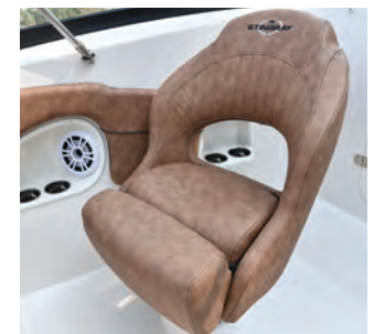
Sport Bucket with Flip-Up Bolster