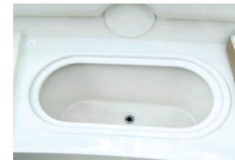
Fish Storage Box / Cooler