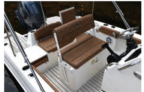
Center Console Deck Boat Interior - Center Console, Captain's Bench, Rear Bench, & Flip-Up Seats (186CC shown)