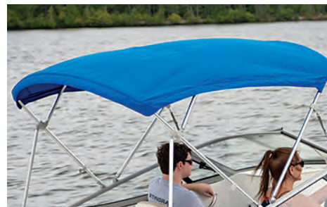
Bimini Top (shown in optional bavarian) with Windshield Connector (not shown) - Option #65

Prices and specifications subject to change. Only the most popular standard and optional equipment items are shown. For the current and complete list of items, visit stingrayboats.com/options