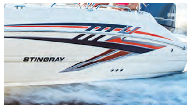
Hyper Graphic (Orange) - Option #350