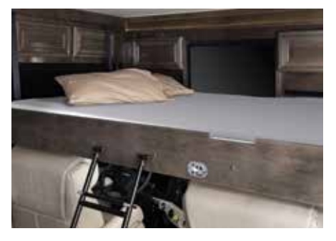
HIDE-A-LOFT<sup>™</sup> DROP DOWN BED Invite more guests on your road trip without compromising space featuring industry-leading headroom and up to 500lb. capacity.