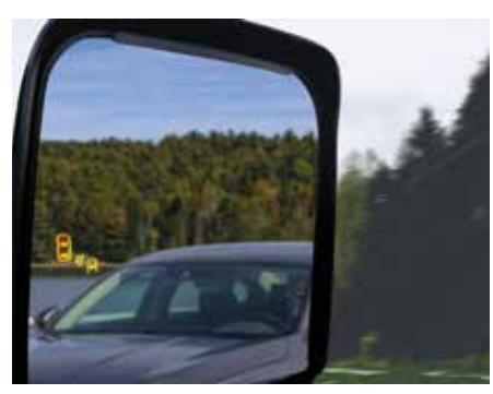
BLIND SPOT DETECTION

Ensure smart, safe driving with Velvac® blind-spot upgraded mirrors for your Discovery LXE. A safety feature, where a light will illuminate on the side mirror if an object is in the blind spot ensuring safe travels. Mirrors are power, heated, remote with turn signals and side cameras.