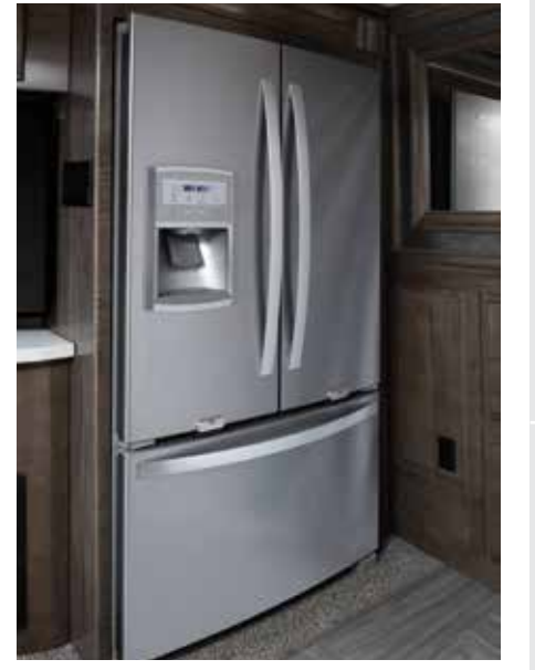
RESIDENTIAL APPLIANCES Whirlpool® refrigerator w/water & ice in-door, microwave and induction cooktop.