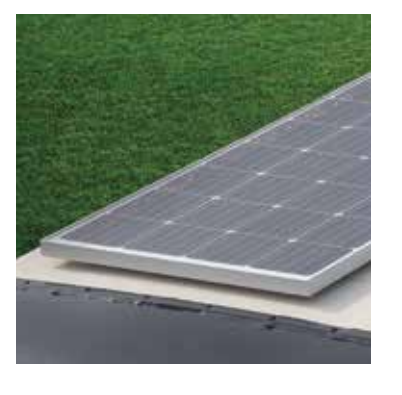
Product information, photography and illustrations included in this publication were as accurate as possible at the time of printing.