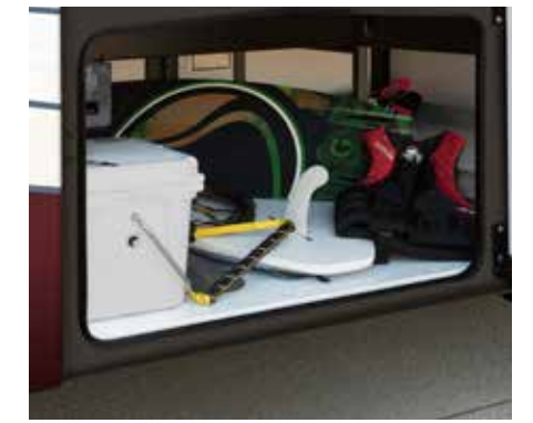
GENEROUS EXTERIOR STORAGE Take along more of what you need and bring home more of what you want, with deep, easy-to-clean pass-through compartments.

TOUCH PAD ELECTRONICS PANEL Easily operate all your RV's systems and accessories with this modern LCD touchscreen control panel. You can even control from your phone with the app.