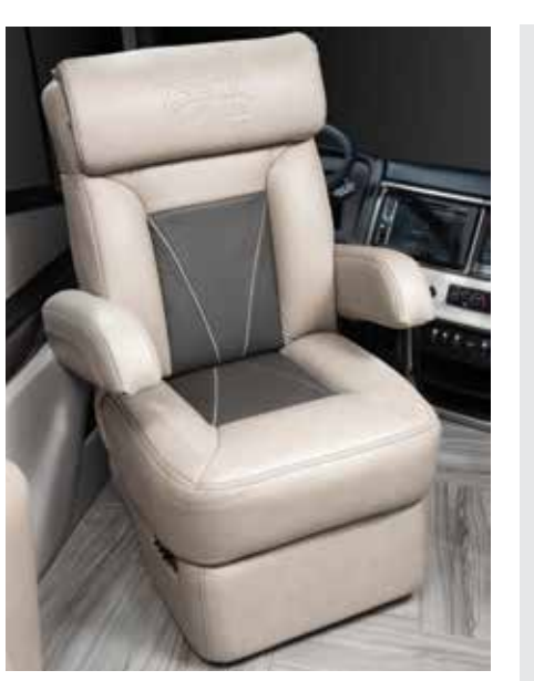
FULLY-ADJUSTABLE ROADWIRE DRIVER AND PASSENGER SEAT Rule the road from your cockpit with recline, swivel and six-way power controls.

TOUCH PAD ELECTRONICS PANEL Easily operate all your RV's systems and accessories with this modern LCD touchscreen control panel. You can even control from your phone with the app.