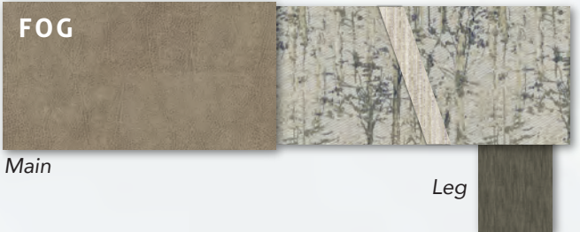
Valance with Accent