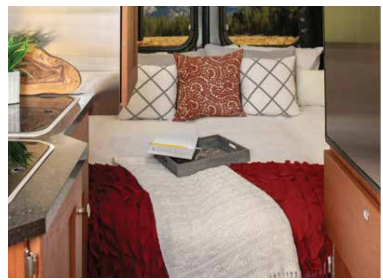
Rear lounge area easily transforms into a sleeping area with a comfortable king size bed.