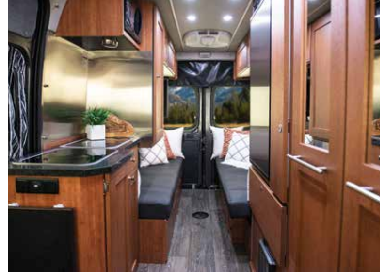
Open aisle floor plan allows for flexibility in sleeping accommodations and storage of large items.