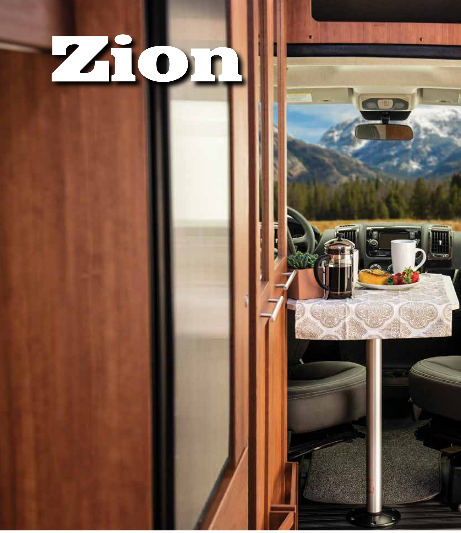
Spacious front dining area comfortably seats two.