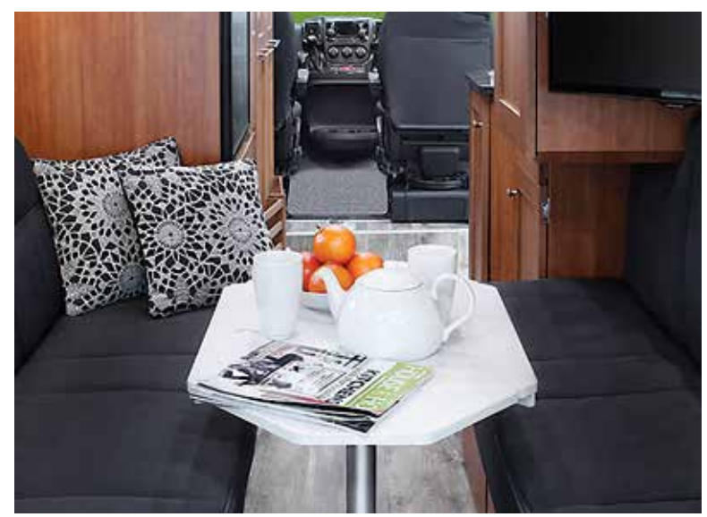
Rear lounge area offers a great place to relax, work or dine.