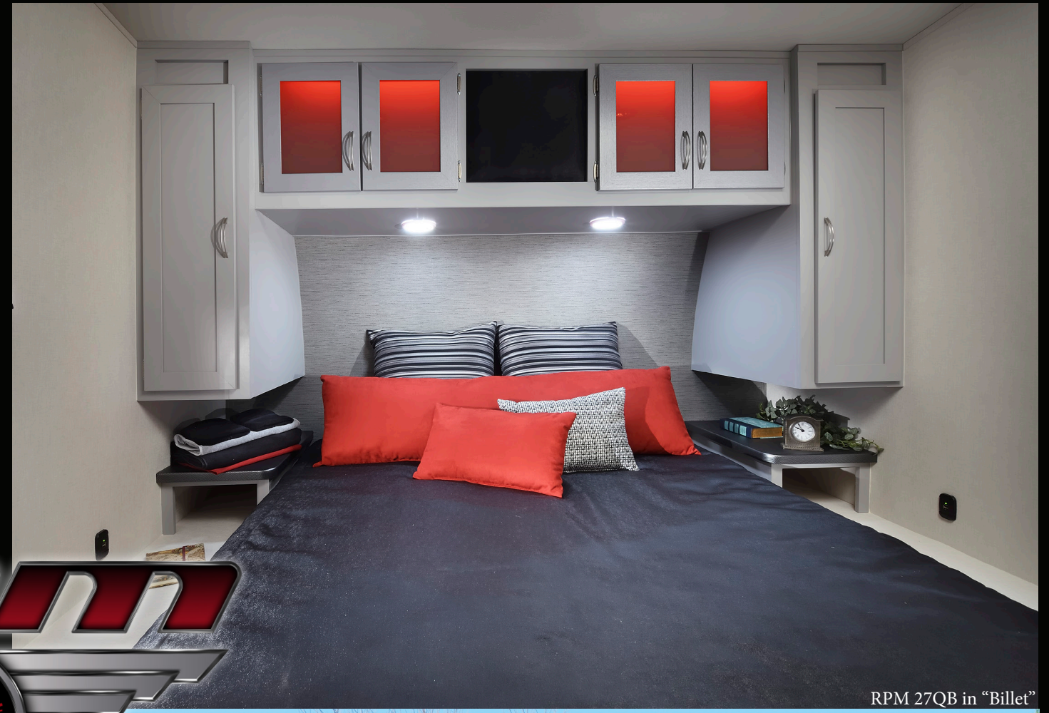
RPM 27QB in "Billet"