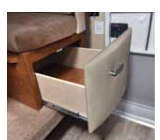
Large lockable dinette storage drawers utilize residential dovetail construction for strength. - 855s, 975, 995, 1062 & 1172