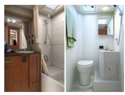
Wet and dry baths