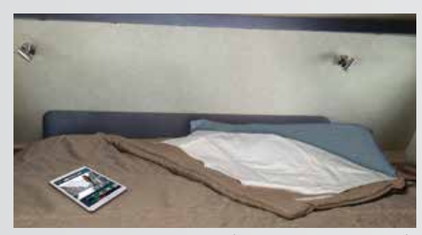
Exclusive Lance Bed-Maid System w/removable sheets & summer/ winter sides provide a warm, laundry friendly bedding alternative.