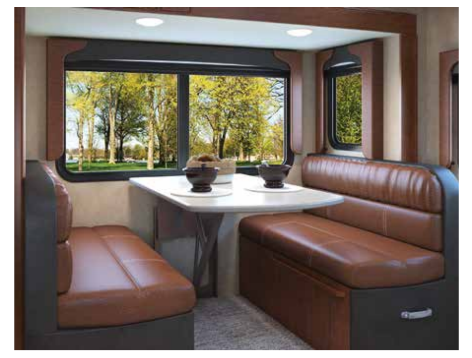
995 shown in Roadster