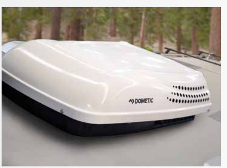
Dometic Penguin II 10K low profile a/c runs on 2,200w generator allowing for off the grid cooling.