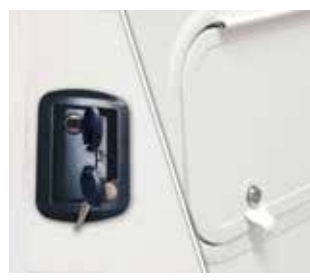
Keyed alike system simplifies your key ring and keeps your belongings safe