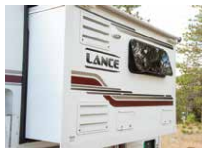
Models with and without slide outs