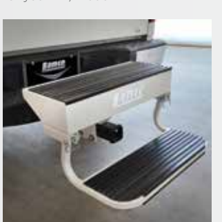
Exclusive Lance ultraSTEPplus gives you safe and secure steps while not impeding your ability to tow. - 650, 865 & 850