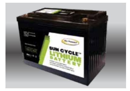
Lithium Battery (1 or 2)