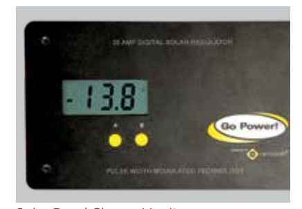
Solar Panel Charge Monitor