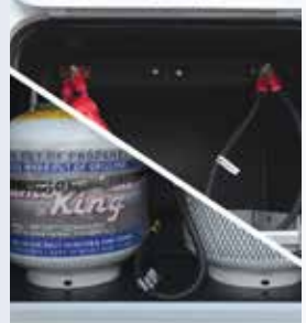
Insulated battery & LP compartments keep your batteries protected and your tanks from freezing.