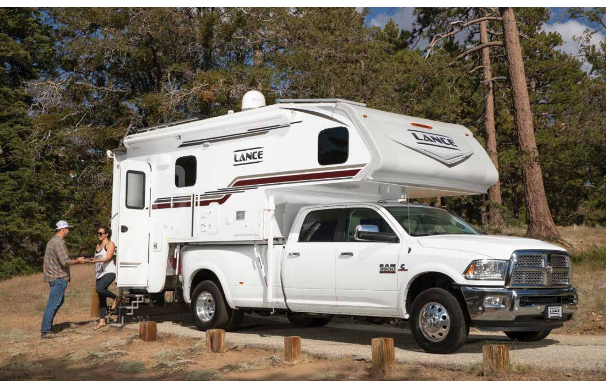
1172 shown with standard graphics