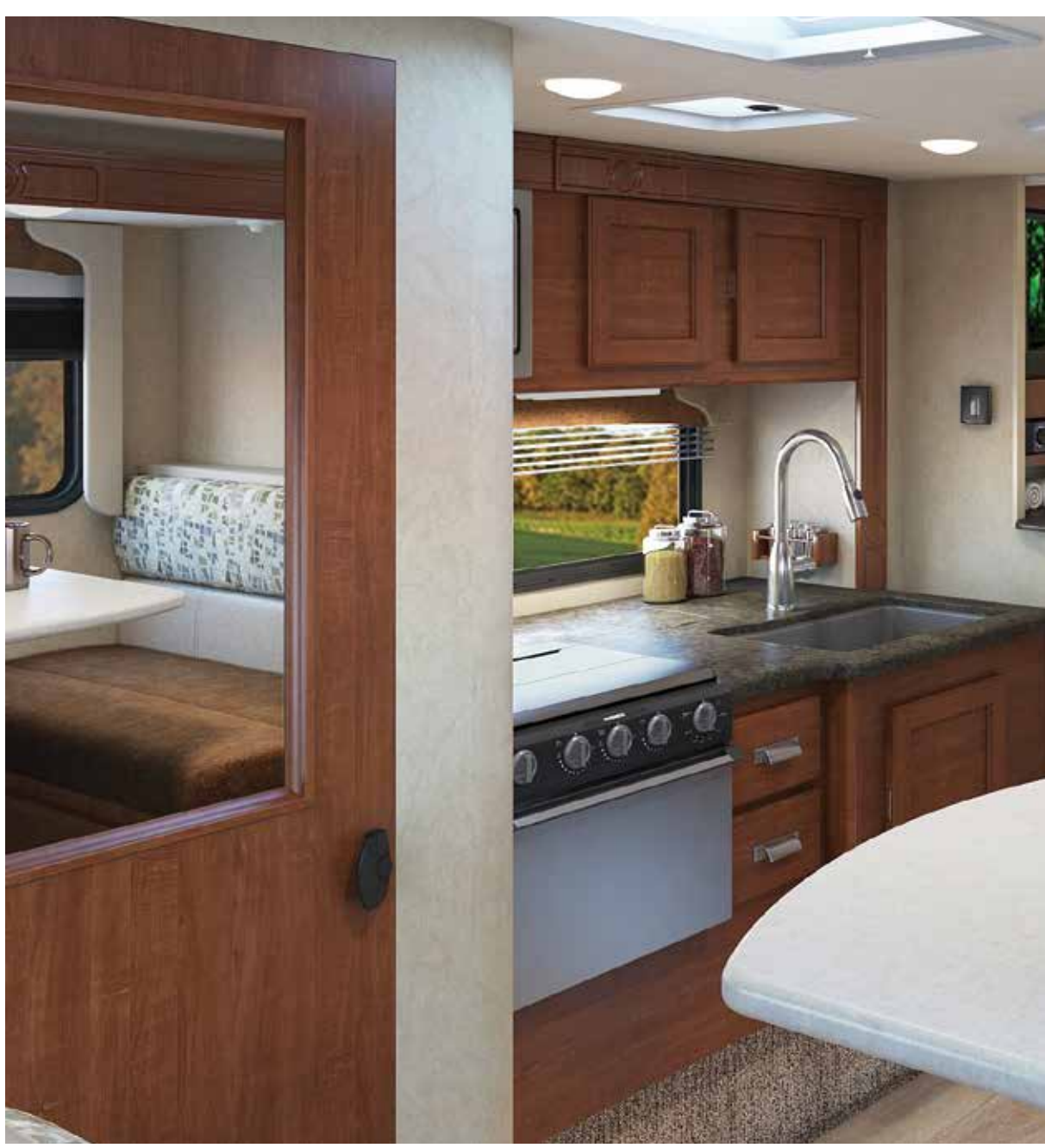
shown in Mystic Shores