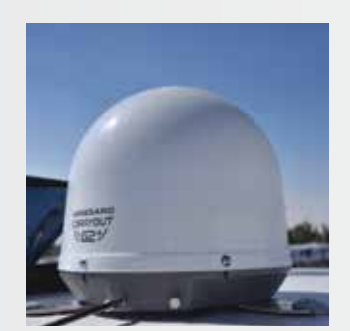
Automatic roof-mounted satellite TV antenna quickly finds the signal for you. - N/A 650