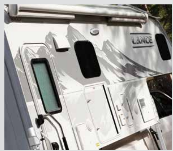
Mountain scene graphics provide a fresh and unique aesthetic evoking the bold spirit of truck camping.