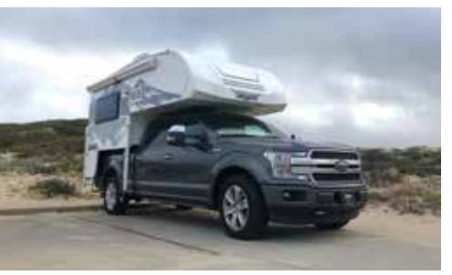
Floor plans to fit most \frac{1}{2} to 1-ton trucks