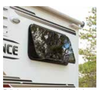
Full view dual-pane tinted windows properly insulate your camper while looking good and crank out to let the breeze in. - N/A 650