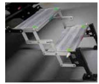
ultraSTEPglow provides sturdy selfilluminating steps for safe and secure entrance and exit. - 1172 only