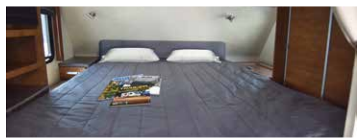
Residential queen 60"x80" innerspring mattress allows for quality rest leading to more adventure. - 650, 825, 865 memory foam