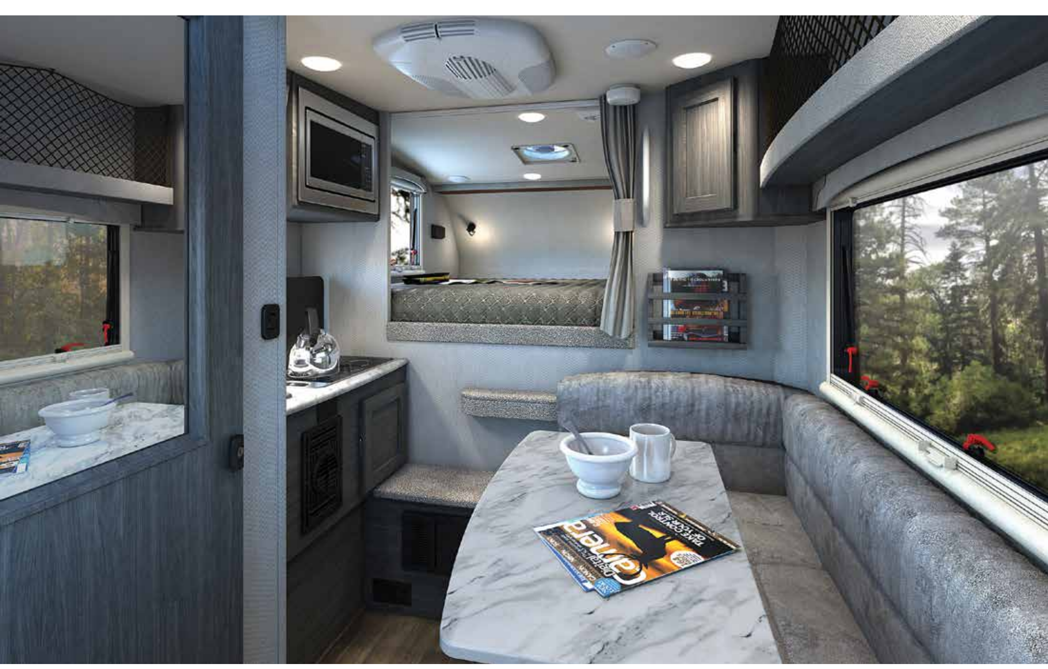
shown in Platinum