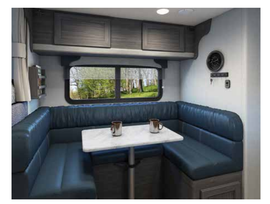
825 shown in Royal