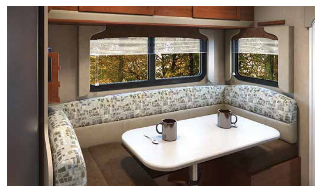
850 shown in Mystic Shores