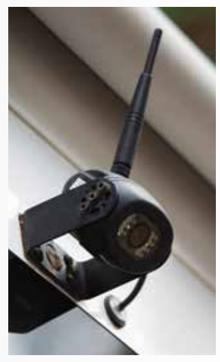
Backup camera w/color display and sound makes backing up a safer, one-person job.