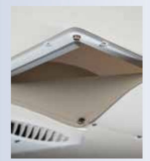
Insulated hatch covers add an additional layer of insulation to vents and sky lights.