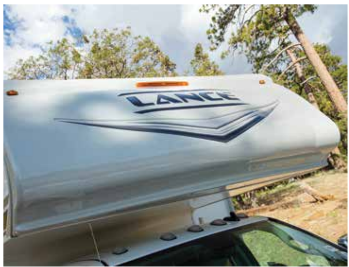
Aerodynamic TPO front nose cap protects your camper from debris and leaks while reducing drag and increasing fuel economy.