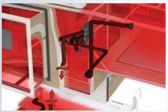
Ducted heat is routed into individually insulated holding tanks to keep them, the valves and PEX lines warm.