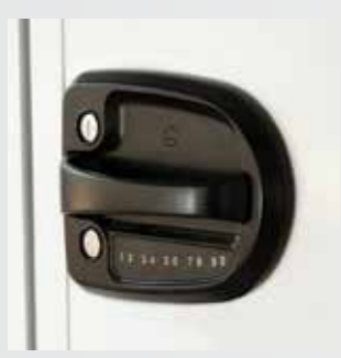
Keyless entry with fob provides secure one button operation of your entry door, just like you have on your truck.