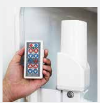
Remote control operated electric jacks take the haste out of loading and unloading your camper.