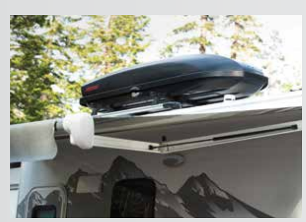
Exclusive Lance Load Roof Rack system safely stores your canoe, kayak, paddle boards, storage box..etc. - N/A 650