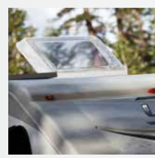
Heki dual-pane vent increases ventilation in the cabover and lets you look out at the stars. - N/A 650, 825 & 865