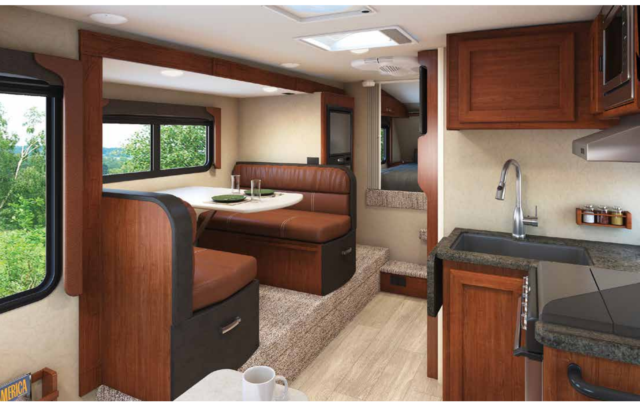
1172 shown in Roadster