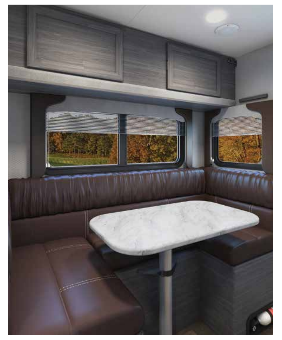
865 shown in Java