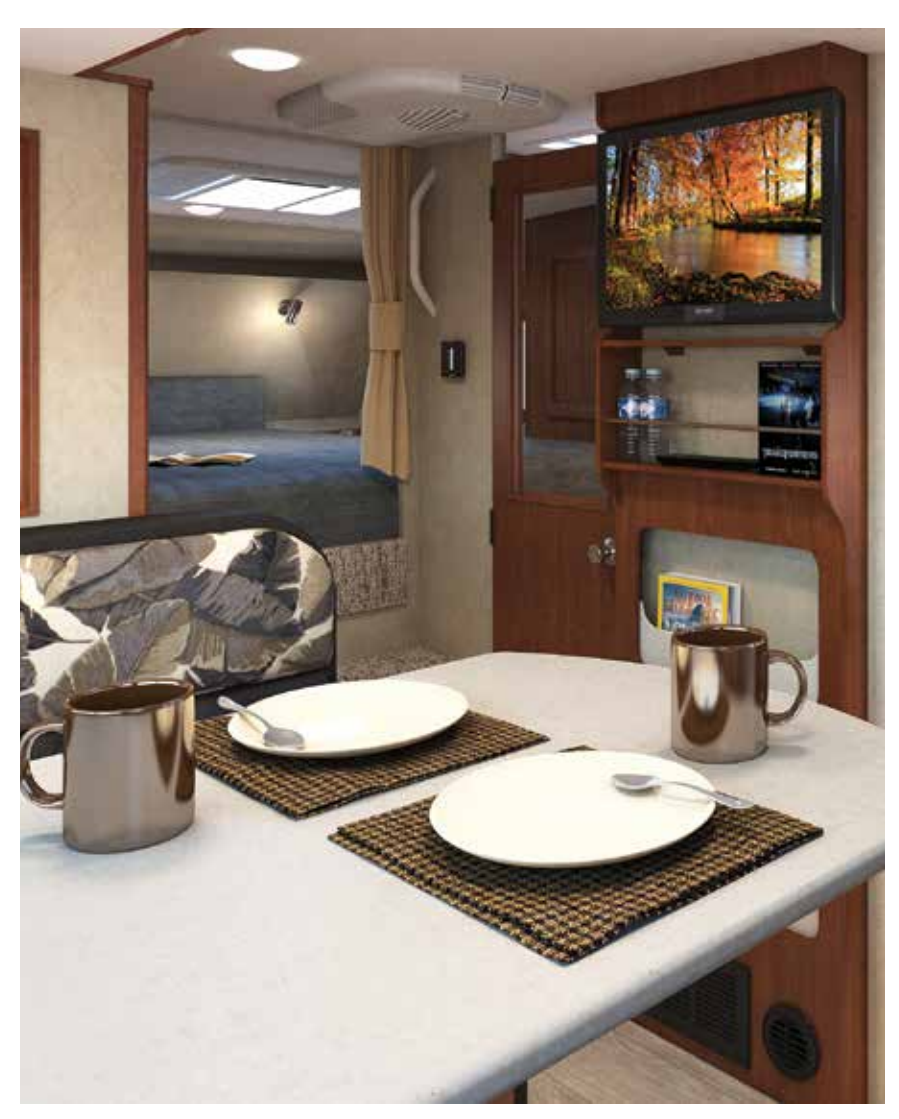
975 shown in Passage