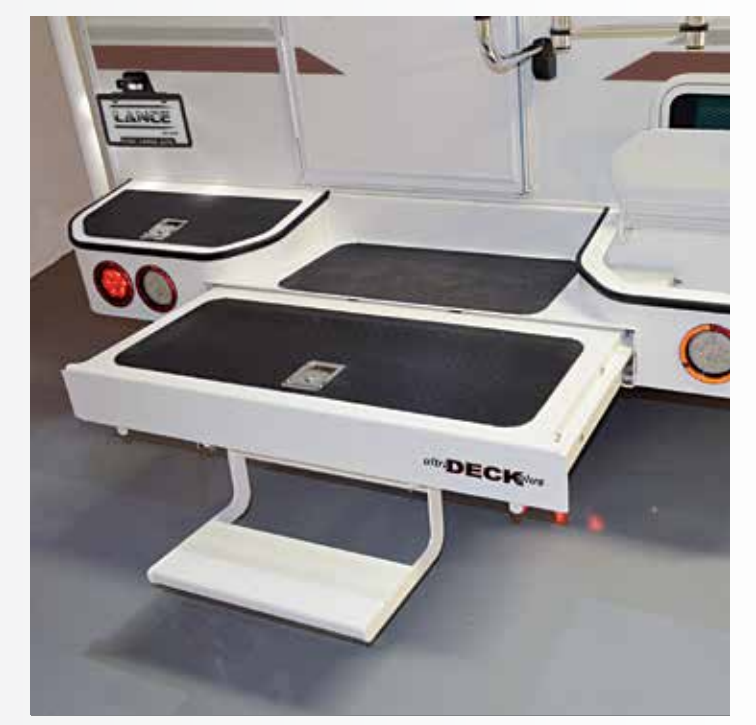
Lance exclusive ultraDECKplus offers extra storage and a spacious entry/exit platform. - 975, 995 & 1062