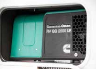
2500w Generator- 855s, 975, 995, 1062, 1172