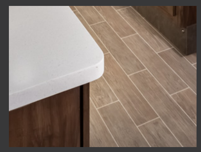
LG Solid Surface Countertop