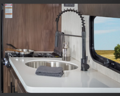
Residential Pullout Faucet