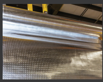
Thermo-Foil Arctic Insulation