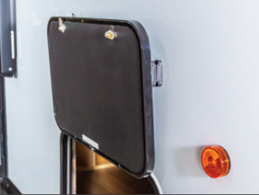
Hands Free Baggage Door Catch