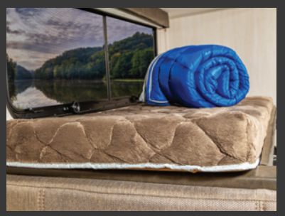
Oversized Bunk Pads