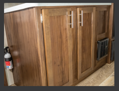
Solid Wood Cabinet Doors