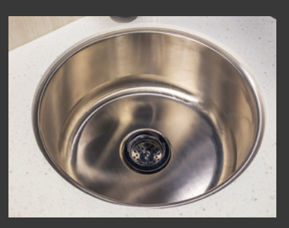
Deep Stainless Steel Sink