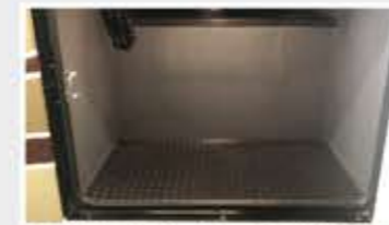
GALVANIZED STEEL STORAGE COMPARTMENT WITH RUBBER STORAGE PROTECTION FOR YOUR PERSONAL ITEMS

All sidewalls, floors and slide pieces are vacuum bond laminated and constructed with high strength low alloy steel. We surround every opening with HSLA. HSLA is a type of alloy steel with low carbon content which provides superior mechanical properties and resistance to corrosion.