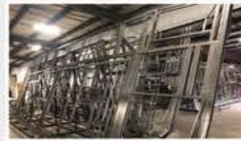
HSLA -HIGH STRENGTH LOW ALLOY STEEL 72% STRONGER THAN ALUMINUM