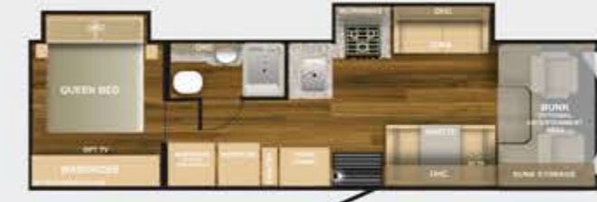
WRAITH 34W | SLEEPS 8