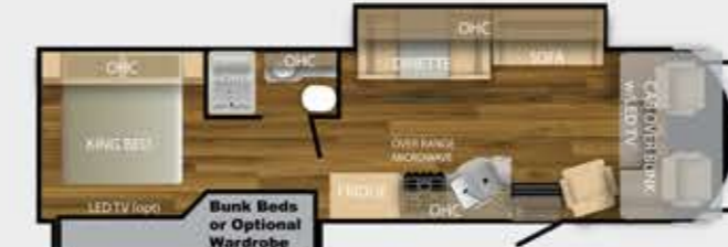
WRAITH 35W | SLEEPS 8-10