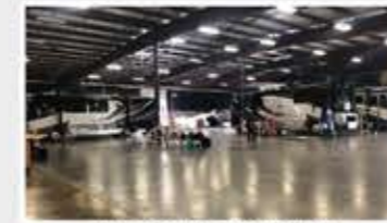
FULL CAMPING SIMULATION YOUR UNIT IS WORKING BEFORE THE DEALER RECEIVES IT