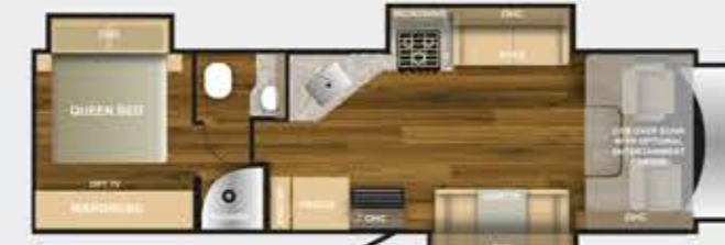
WRAITH 33W | SLEEPS 8