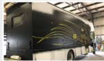
SHERWIN WILLIAMS RV SPECIFIC PRIMER, PAINT AND CLEAR COAT NO FLAKING OR DRIPPING