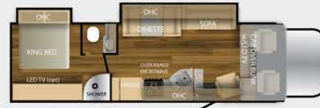
WRAITH 32W | SLEEPS 8