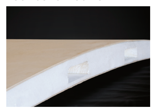
Vacuum-bonded radius roof with vaulted ceiling providing top notch insulation and greater interior height