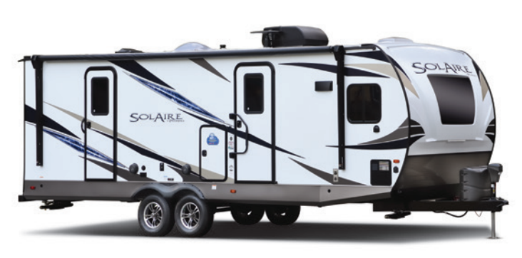
Solaire ultra light travel trailers are easy to tow, yet built to last with a sturdy aluminum framed superstructure for long lasting durability.