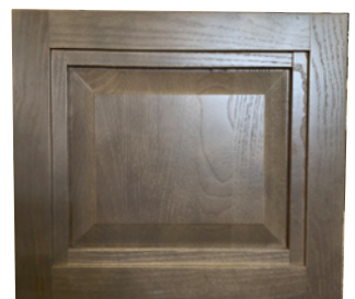
STONE PEBBLE MESA MAPLE GREYSTONE MAPLE