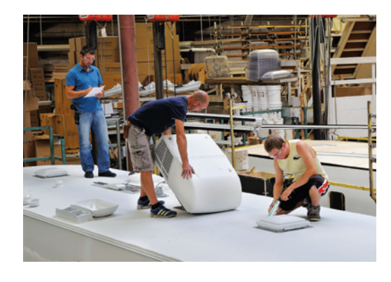
Built stronger to allow for periodic roof maintenance.