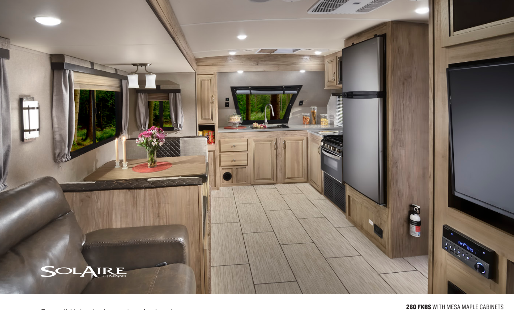
Two available interior decor and wood grain options to accommodate all design preferences.