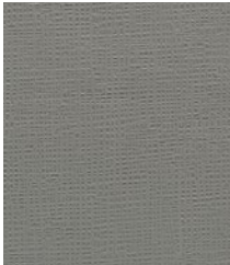
Bedding FTB Only