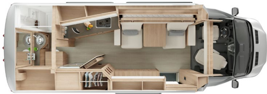
W24MB | Murphy Bed