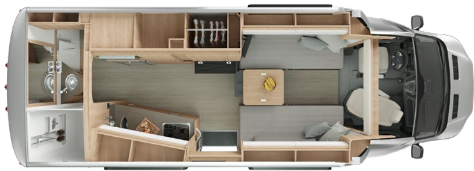
W24FTB | Front Twin Bed