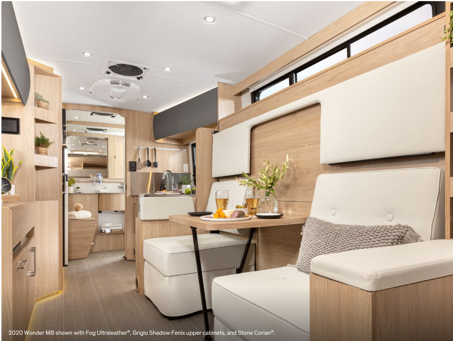
2020 Wonder MB shown with Fog Ultraleather®, Grigio Shadow Fenix upper cabinets, and Stone Corian®.