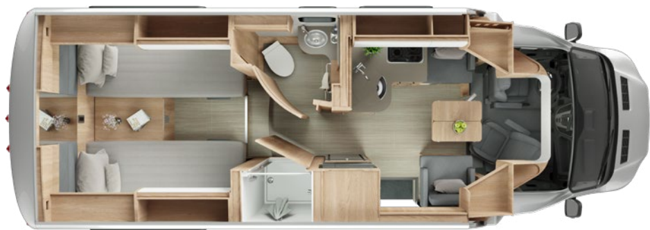
W24RTB | Rear Twin Bed