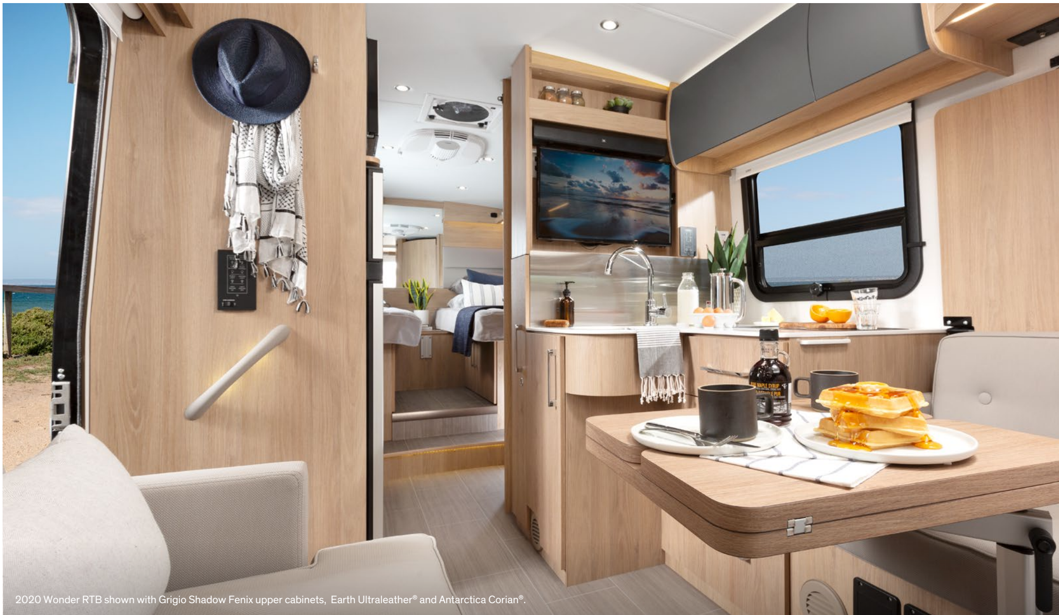
2020 Wonder RTB shown with Grigio Shadow Fenix upper cabinets, Earth Ultraleather® and Antarctica Corian®.