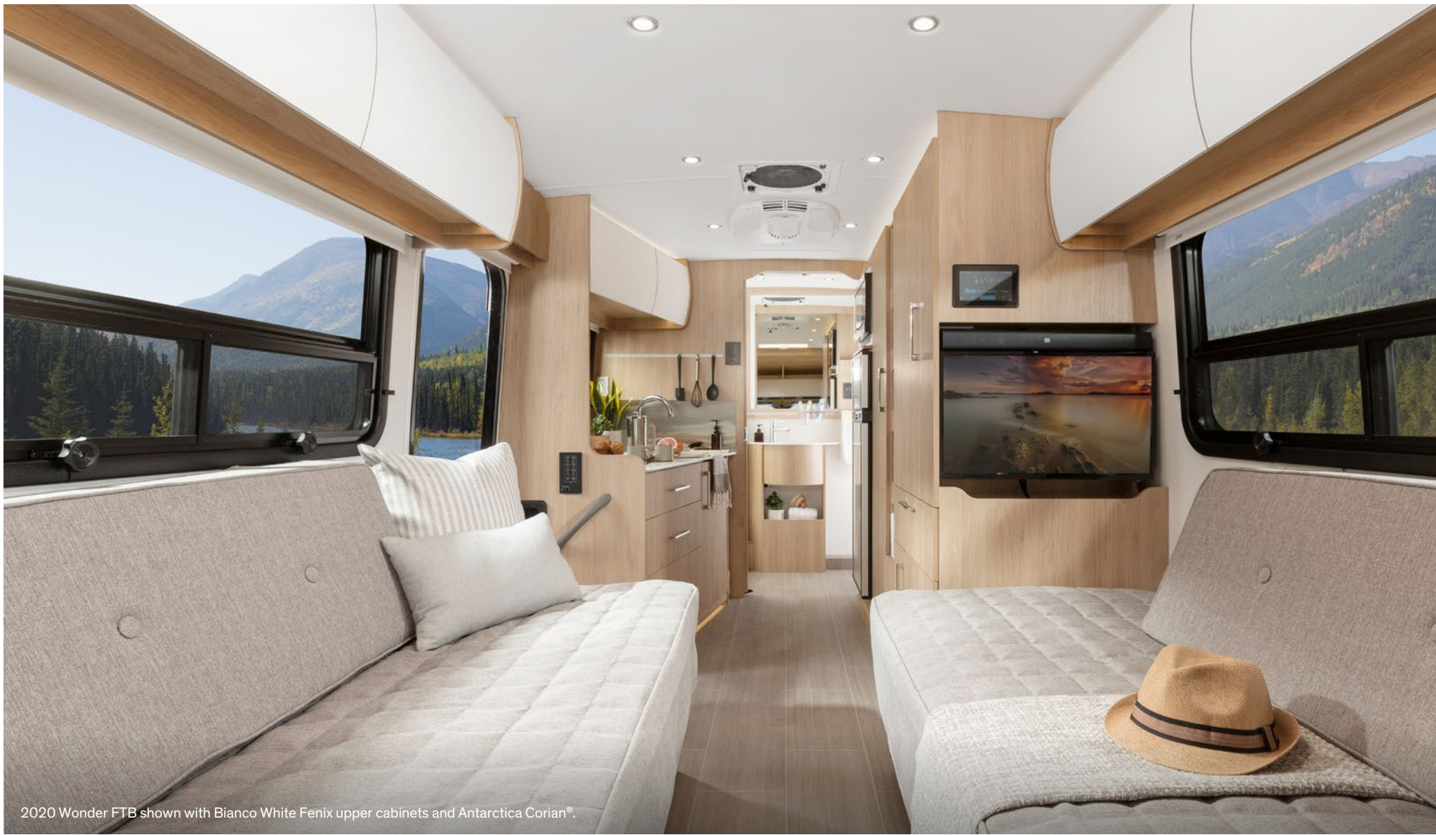
2020 Wonder FTB shown with Bianco White Fenix upper cabinets and Antarctica Corian®.