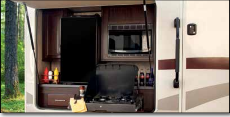
Outdoor Kitchen Available On 297RK, 298RL, 366RL, 374BH and 378MB