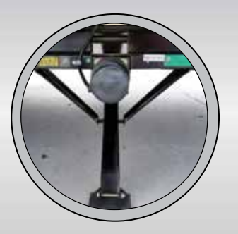
ELECTRIC STABILIZER JACKS