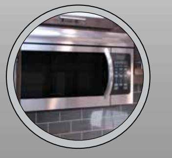
30" CONVECTION OVEN MICROWAVE