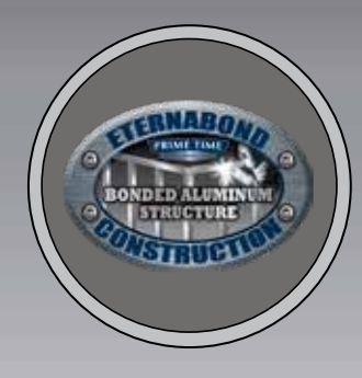
EXCLUSIVE ETERNABOND CONSTRUCTION