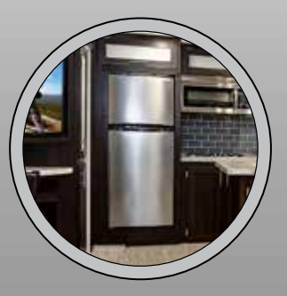
LARGE STAINLESS STEEL RESIDENTIAL REFRIGERATOR