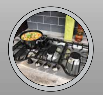
FURRION RESIDENTIAL COOKTOP