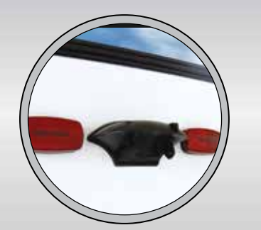
BACK UP CAMERA PREP