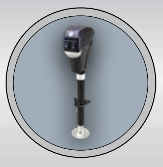
ELECTRIC TONGUE JACK