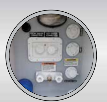
UNIVERSAL DOCKING CENTER