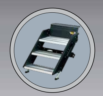
"SOLID STEP" FOLD-DOWN STEPS