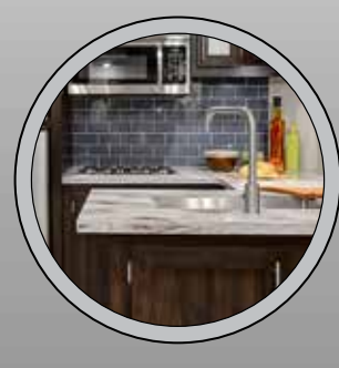
SOLID SURFACE COUNTERTOPS