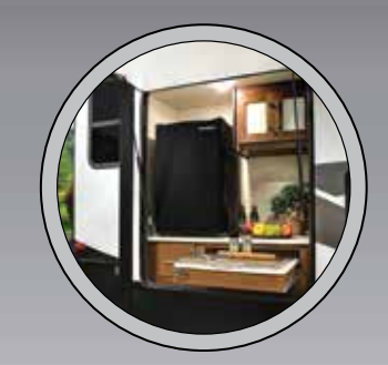
OUTDOOR CAMP KITCHEN (SELECT MODELS)