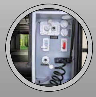
UNIVERSAL DOCKING STATION