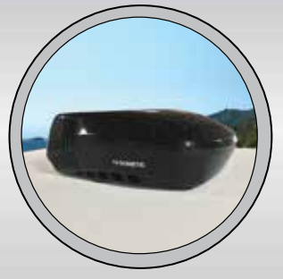
15K "QUIET COOL" A/C