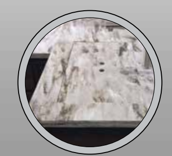
SOLID SURFACE COUNTERTOPS