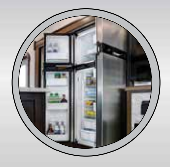
4-DOOR GAS/ELECTRIC REFRIGERATOR