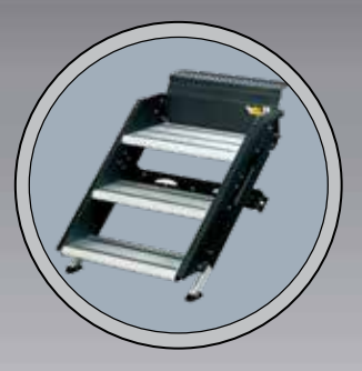
"SOLID STEP" ENTRY STEPS