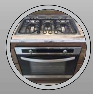
CHEF COLLECTION OVEN AND COOKTOP