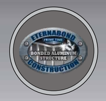
EXCLUSIVE ETERNABOND® CONSTRUCTION