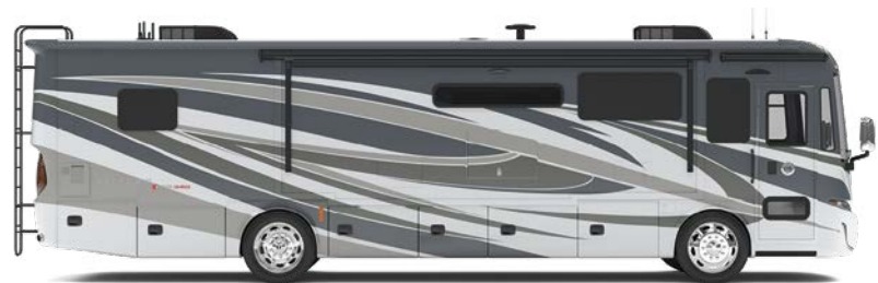
G1 SLATE GRAY