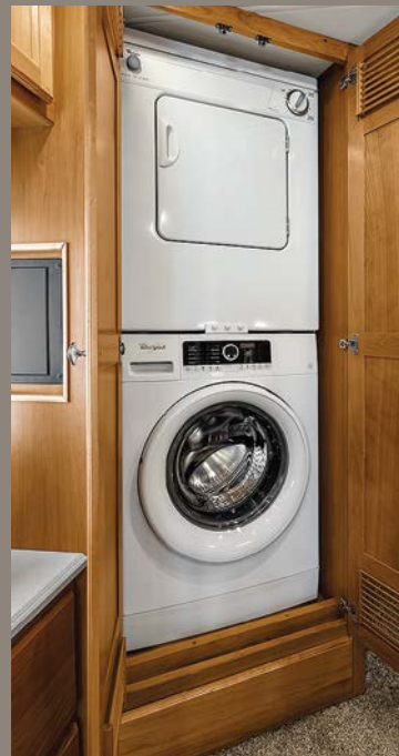
Clockwise from top: Master Bathroom vanity; Optional Stacked Washer and Dryer; Shower.