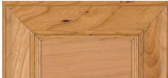
NATURAL ALDER (O)