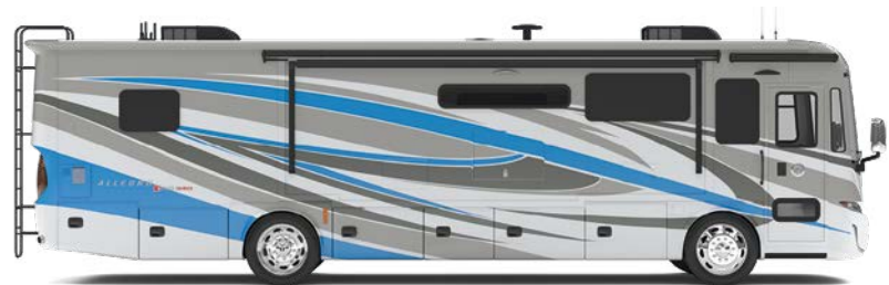
G1 GLACIER BLUE