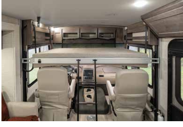
Available Powered StudioLoft<sup>™</sup> Bed with 600-lb. capacity turns the cab of your coach into a second bedroom.