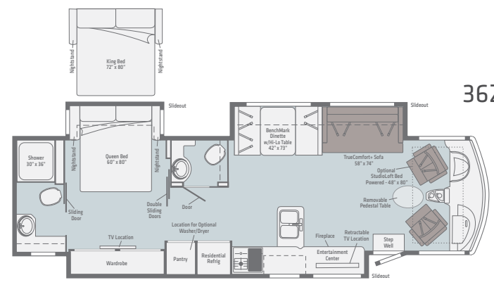
36Z Length 36'10" Ext. Height 12'4" Ext. Storage (cu. ft.) 122.2

Length 30'3" Ext. Height 12'2" Ext. Storage (cu. ft.) 145