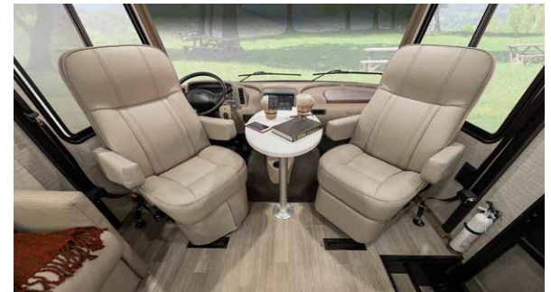
Versa Driver's Seat offers optimal seatbase placement with enhanced range of motion, driving comfort and easy-swivel to become an integral part of the living space.

Corian Countertops are beautiful, durable, long-lasting, and easy to maintain.