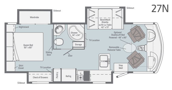
Length 28'5" Ext. Height 12'2" Ext. Storage (cu. ft.) 123