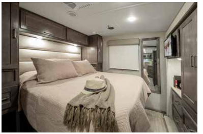
Walkaround Queen Bed (available King in 33C and 36Z) features a foam mattress (and plenty of storage below), so you can sleep well in the spacious bedroom.

BenchMark® Dinette with Hi-Lo Table features Primera Ultraleather with superior innerspring seat construction, and provides additional storage and sleeping space.