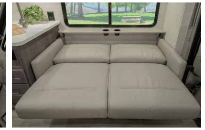
Memory Foam Sleeping Surface makes it easy to convert from a sofa to a comfortable bed and back again.