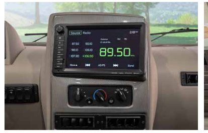
10" Radio Display Monitor includes; HDMI, Bluetooth<sup>®</sup>, USB port, Sirius XM<sup>®</sup>-ready, rear camera and side cameras for viewing.