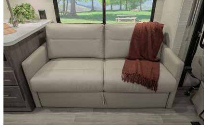
TrueComfort+ Sofa Sleeper; good by day and good by night.