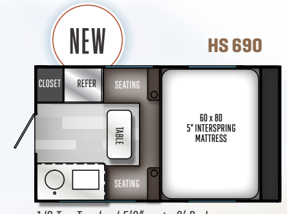
1/2 Ton Truck w/ 5'6" up to 8' Bed