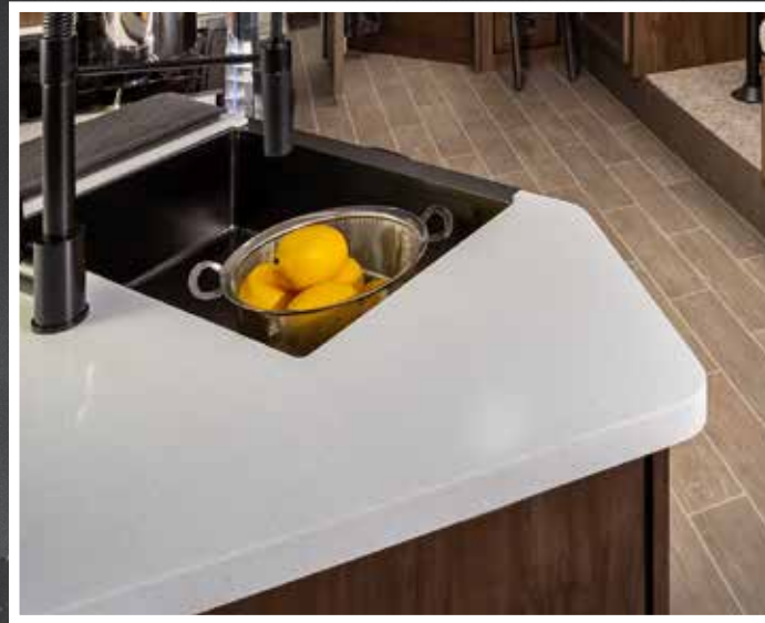
LG SOLID SURFACE COUNTERTOP