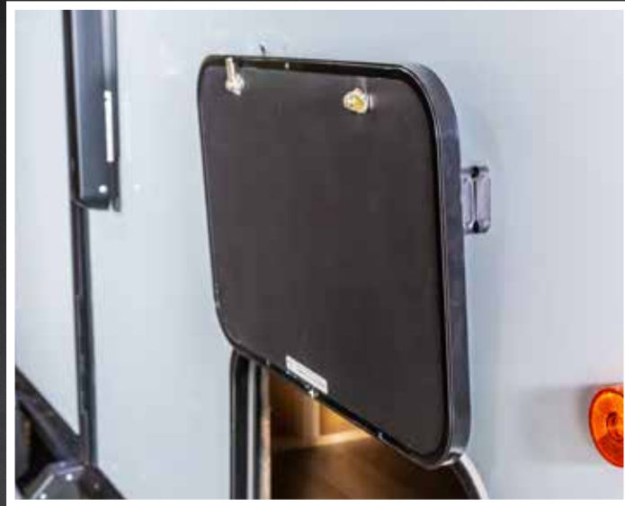
HANDS FREE BAGGAGE DOOR CATCH