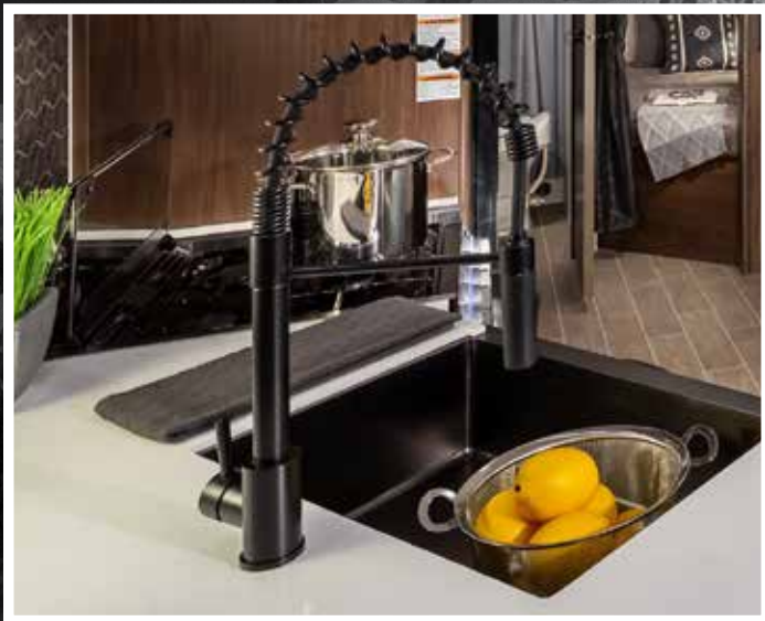
RESIDENTIAL PULLOUT FAUCET