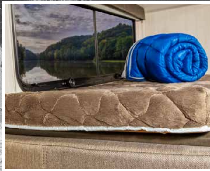
DVERSIDED BUNK PADS