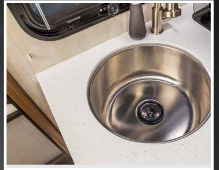
DEEP STAINLESS STEEL SINK