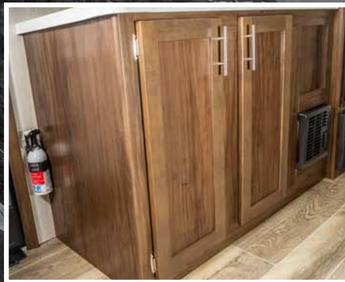
SOLID WOOD CABINET DOORS