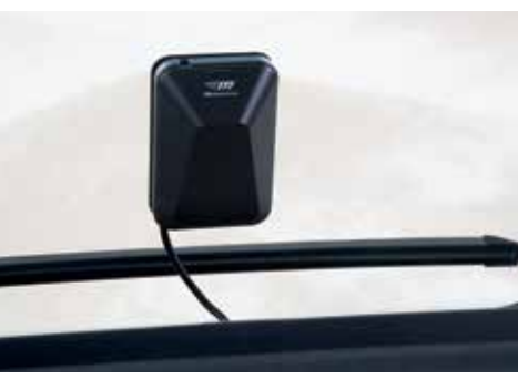
KENWOOD® COLLISION MITIGATION (UPGRADE)

Kenwood Collision Mitigation System offers forward collision warning, lane departure warning, headway monitoring, pedestrian and bicycle collision warning, and speed limit indication.