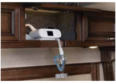
CPAP MACHINE STORAGE (STANDARD) Sleep like a baby while logging miles! Your Vacationer has a designated storage area for your CPAP machine above the masterbed where you can conveniently access and use your machine just like the doctor ordered.

Kenwood Collision Mitigation System offers forward collision warning, lane departure warning, headway monitoring, pedestrian and bicycle collision warning, and speed limit indication.