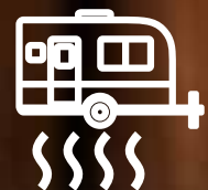
HEATED & ENCLOSED UNDERBELLY

Tow Vehicle Caution: Owners of Heartland recreational vehicles are solely responsible for the selection and proper use of tow vehicles. All customers should consult with a motor vehicle manufacturer or their dealer concerning the purchase and use of suitable tow vehicles for Heartland products. Heartland disclaims any liability or damages suffered as a result of the selection, operation, use or misuse of a tow vehicle. Heartland's limited warranty does not cover damage to the recreational vehicle or the tow vehicle as a result of the selection of the tow vehicle.