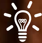
LED INTERIOR AND EXTERIOR LIGHTING