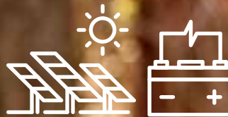
EARTH FRIENDLY SOLAR PREP