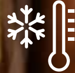
H - DUCTED A/C SYSTEM