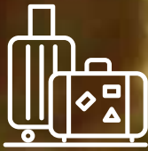
FINISHED PASS-THRU STORAGE COMPARTMENT