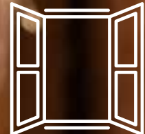
EXTRA-LARGE WINDOWS FOR CROSS-VENTILATION