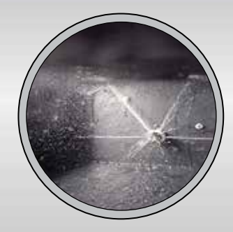
BLACK TANK FLUSH (N/A ATI)