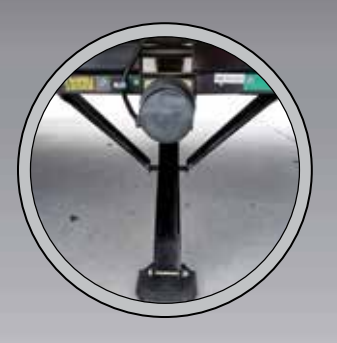
ELECTRIC STABILIZER JACKS (N/A ATI)