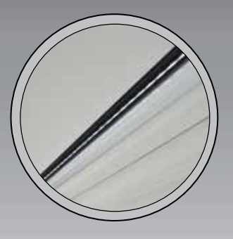
LED LIT POWER AWNING