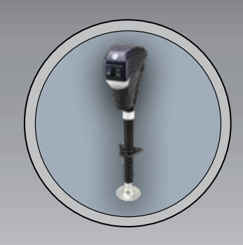
ELECTRIC TONGUE JACK (N/A ATI)