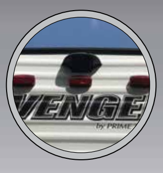
BACK UP CAMERA PREP