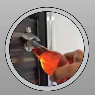
EXTERIOR BOTTLE OPENER