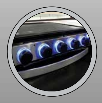
GLASS TOP STOVE WITH LED LIGHTING