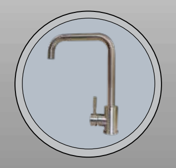
RESTAURANT STYLE KITCHEN FAUCET