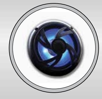
BLUE LED LIT OUTDOOR SPEAKERS