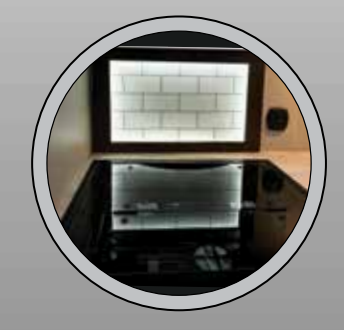
LED LIT KITCHEN BACKSPLASH