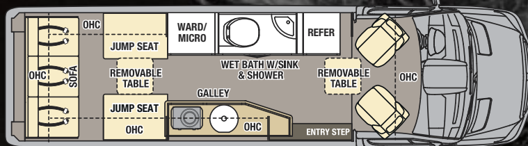
24FL – Power Sofa with Double Captains Chairs