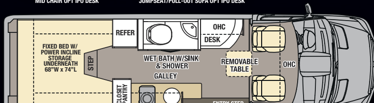
NEW! 24A – Rear Bed with Double Captains Chairs

GVWR (Gross Vehicle Weight Rating) - is the maximum permissible weight of the unit when fully loaded. It includes all weights, inclusive of all fluids, occupants, cargo, optional equipment and accessories. For safety and product performance do NOT exceed the GVWR. GCWR (Gross Combined Weight Rating) - is the maximum permissible loaded weight of your motor home and any towed trailer or towed vehicle. Actual GCWR of this vehicle may be limited by the sum of the GVWR and the installed hitch receiver maximum capacity rating; see hitch rating label for detail.