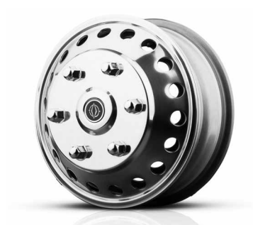
Steel Wheels Standard – With Wheel Simulators