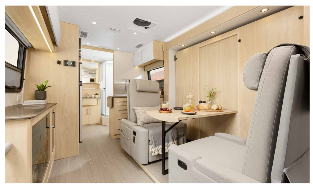
Sierra Maple Shown with Bianco White Fenix Glamour Upgrade