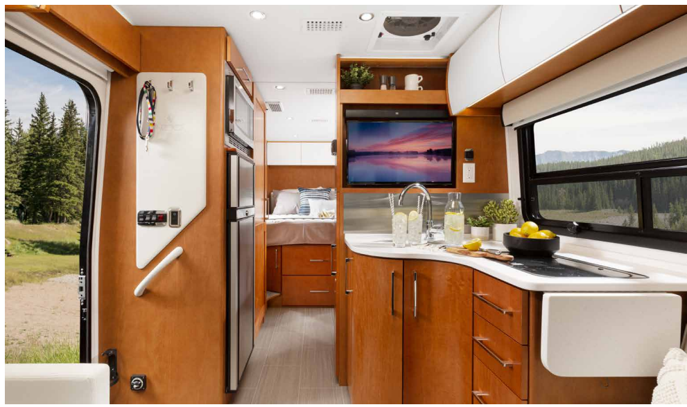
Espresso Brown Shown with Bianco White Fenix Glamour Upgrade