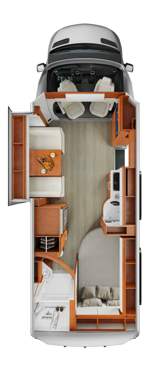
U24CB | Corner Bed (Shown with Standard Dinette)