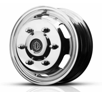
Alcoa Dura-Bright® Aluminum Wheels Optional – All 6 Aluminum Wheels, 4 Dura-Bright® Wheels