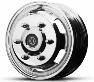
Alcoa Dura-Bright® Aluminum Optional – All 6 Aluminum Wheels, 4 Dura-Bright® Wheels