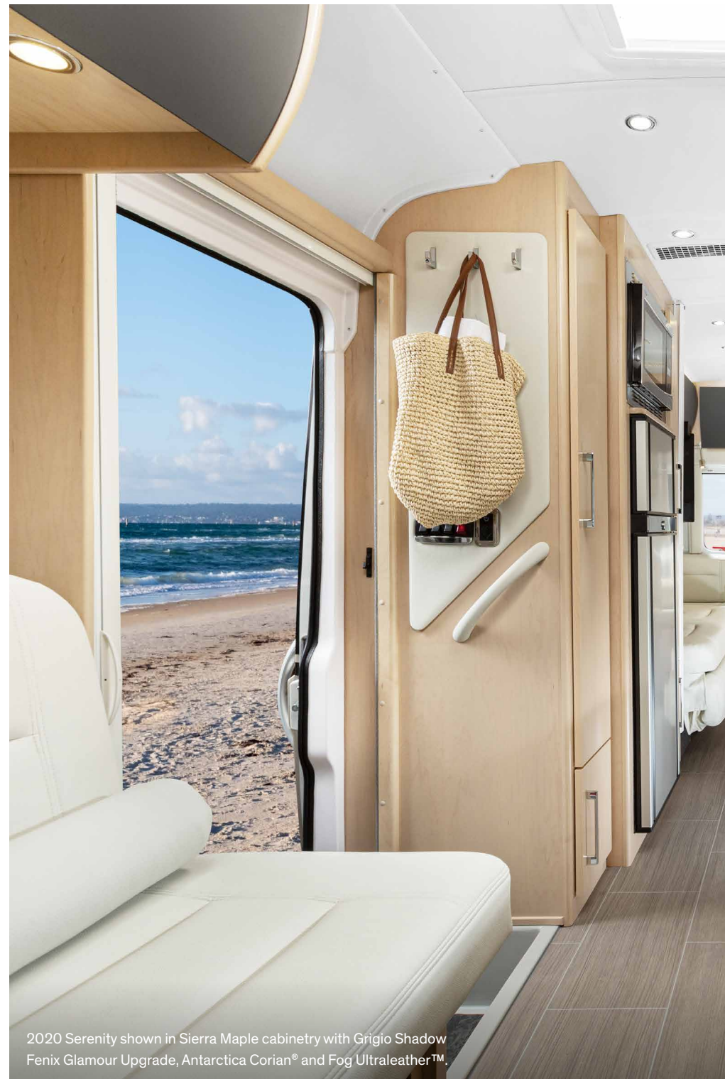
2020 Serenity shown in Sierra Maple cabinetry with Grigio Shadow Fenix Glamour Upgrade, Antarctica Corian® and Fog Ultraleather™.