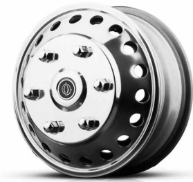
Steel Standard – With Wheel Simulators