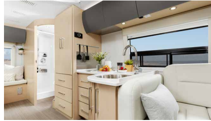
Sierra Maple Shown w/ Glamour Upgrade