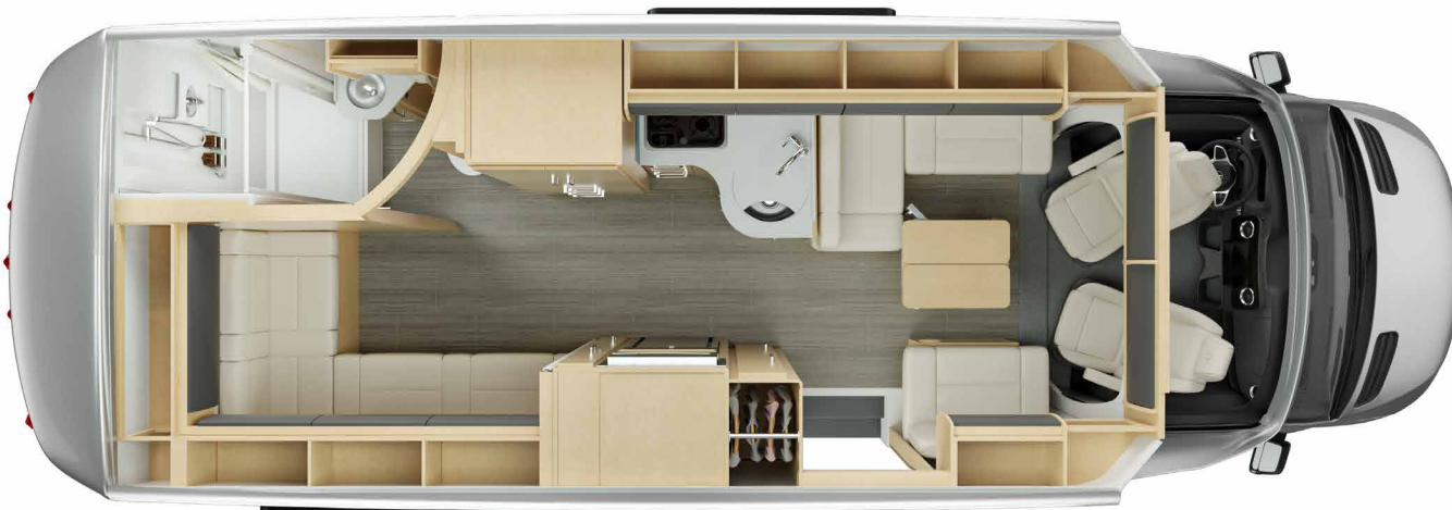
Optional Rear Power Trifold Sofa/Bed