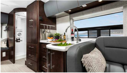
Espresso Brown Shown w/ Glamour Upgrade Previous Year Model Shown