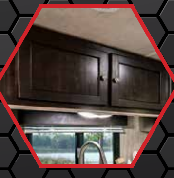
Hidden Hinge Hardwood Cabinets