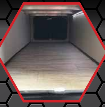
Oversized Storage 40'+ cu. ft.