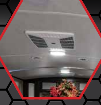
Dual Ducted A/C System