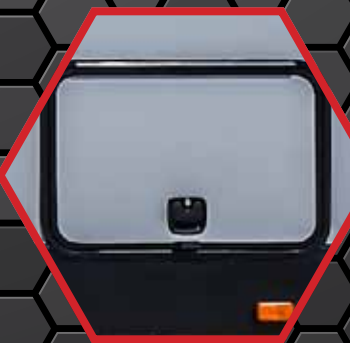
Slam Latch System