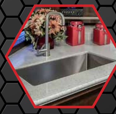
Stainless Steel Sink w/Cover