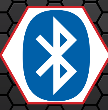
Bluetooth HDMI DVD/Stereo