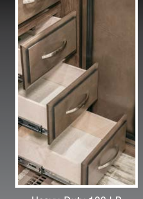
Heavy-Duty 100 LB DRAWER GLIDES