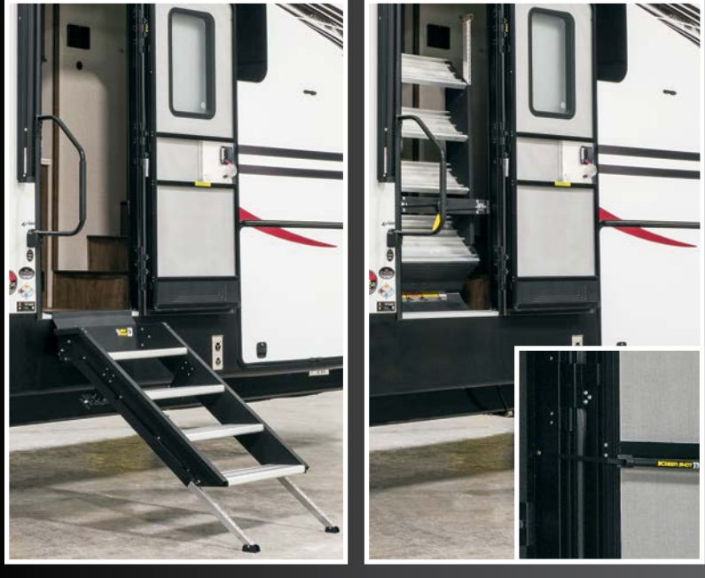
STANDARD FLIP-UP ENTRY STEP with grab handle deploys squarely to provide solid footing. Steps flip up in one easy motion. Handy friction door hinge and screenshot auto-door-close features make usage a breeze