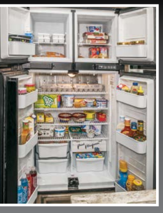
STD 12 CU FT GAS/ELECTRIC refrigerator with (4) doors and temperature controls (F/P specific)