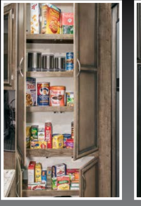
STORAGE Spacious, deep-shelved pantries on some models