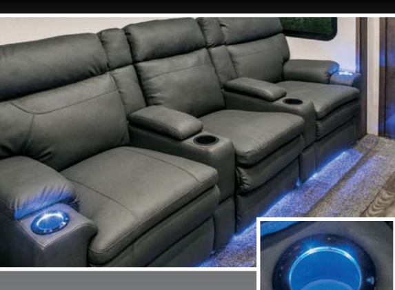
THEATER SEATING with heat, massage, and LED lighted cupholders (on select models)