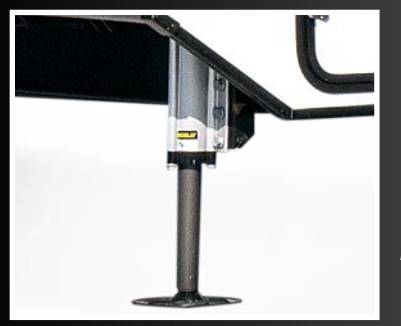
STANDARD 6-POINT HYDRAULIC AUTO-LEVELING SYSTEM does all the work