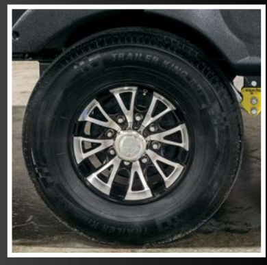
ALUMINUM WHEELS Nitrogen-filled 16-inch tires with aluminum wheels, spare tire and self-adjusting brakes