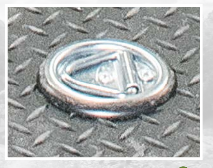
CARGO TIE-DOWNS Sturdy, heavy-duty tie-down rings keep toys in place during travel