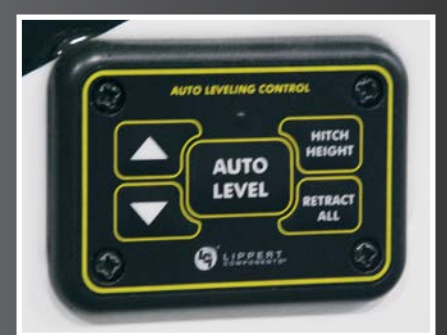
Standard 4-POINT AUTO-LEVELING does all the work