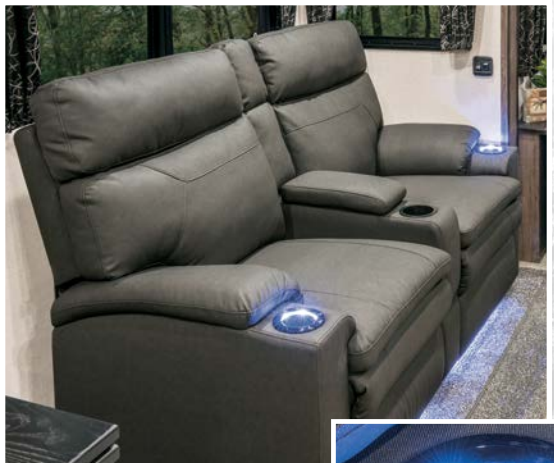
THEATER SEATING with heat, massage, and LED lighted cupholders