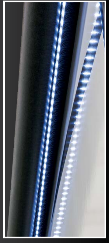
LED LIGHT STRIP makes evening gatherings magical