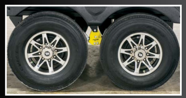
8-lug, heavy-duty, 16-inch ALUMINUM WHEELS with E-range tires (G-range on select models)