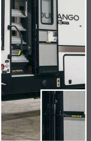
STANDARD FLIP-UP ENTRY STEP CENTRALIZED solid footing, coming and going. Handy friction hinge and screenshot auto-door-close feature