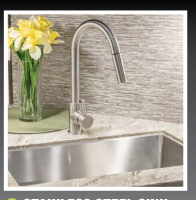
STAINLESS STEEL SINK with pull-down sprayer faucet and seamless