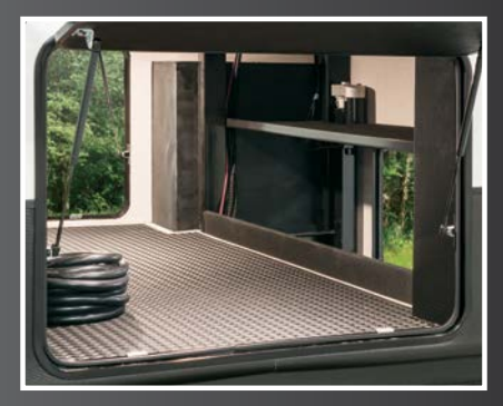
140 CUBIC FOOT BASEMENT STORAGE featuring motion-light