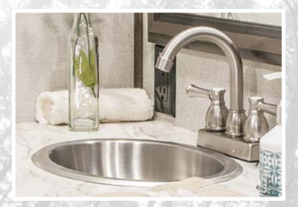
Stainless steel BATH SINK with high-rise faucet