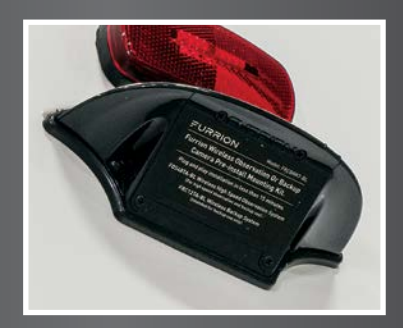
BACKUP CAMERA PREP