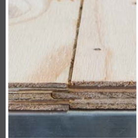
5/8" TONGUE & GROOVE PLYWOOD