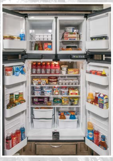
12 CU FT gas/electric 4-DOOR REFRIGERATOR with temperature controls