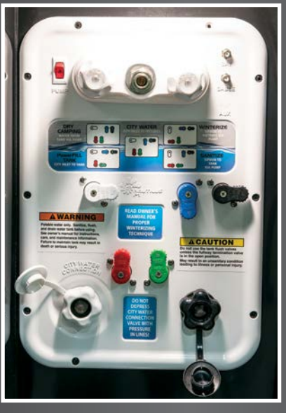
COMMAND CENTER well-lit, heated & all systems conveniently located