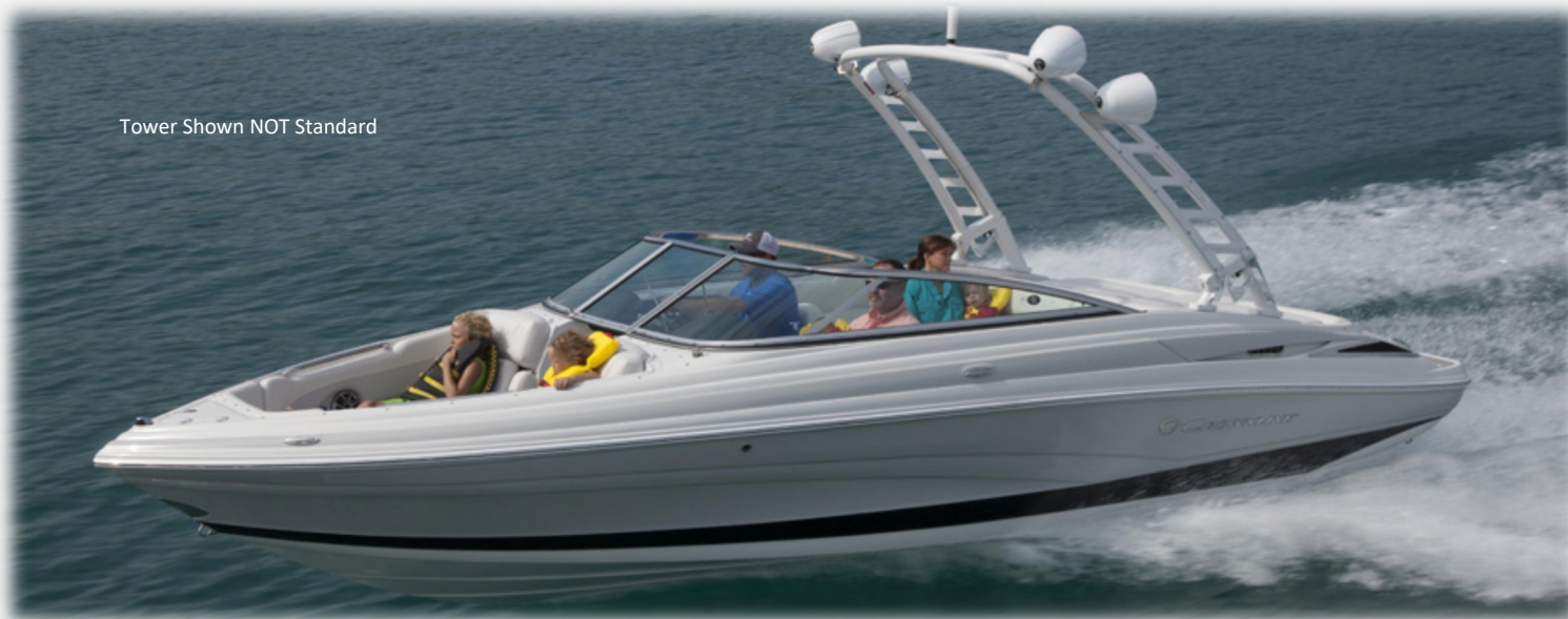
Tower Shown NOT Standard

LOA: 23'5" BEAM: 102" FUEL: 45 GAL MAX HP: 430 DEADRISE: 19 CAPACITY: 11 PERSONS WEIGHT: 5011 LBS