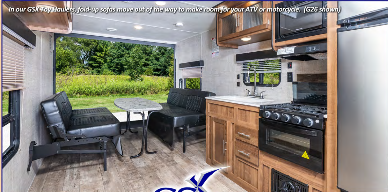
In our GSX Toy Haulers, fold-up sofas move out of the way to make room for your ATV or motorcycle. (G26 shown)