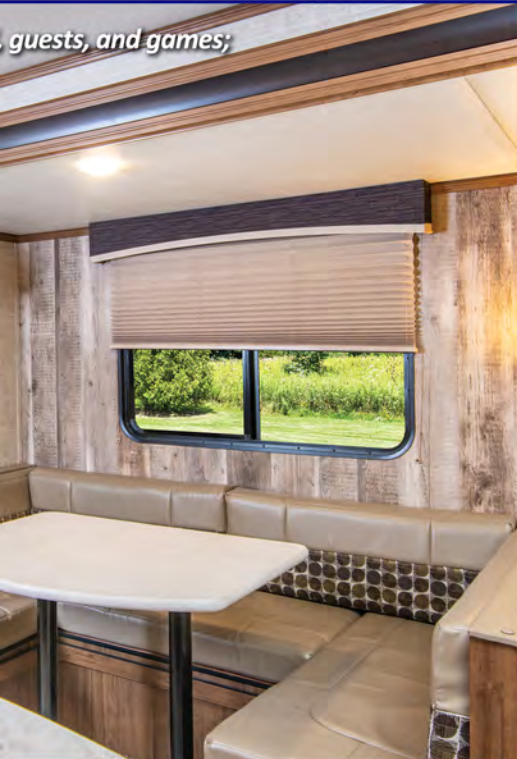
guests, and games;