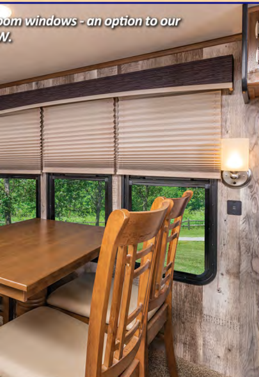
room windows - an option to our W.