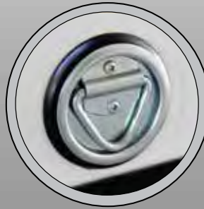
DOGGY D-RING PET SECUREMENT