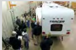
Executive Quality Audits