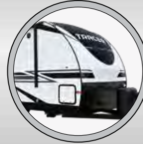
AERODYNAMIC PROFILE WITH ROCK GUARD