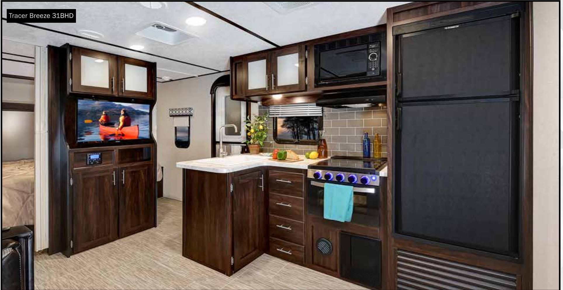
Tracer Breeze 31BHD