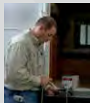
65 Point Secondary PDI