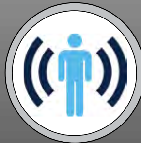
MOTION SENSOR LIGHTING