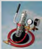
Seek-A-Leak Pressure Test

Prime Time Manufacturing is proud to be recognized as an industry leader in value, reliability, and overall quality by the Recreational Vehicle Dealers Association. We are committed to "A Higher Standard" in design, construction, testing, and customer service. Check us out — we know you'll be impressed!