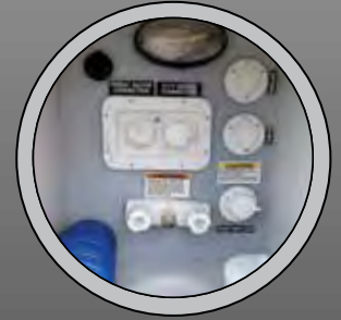
UNIVERSAL DOCKING CENTER (N/A BREEZE)