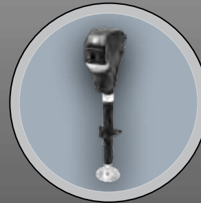
ELECTRIC TONGUE JACK (N/A BREEZE)