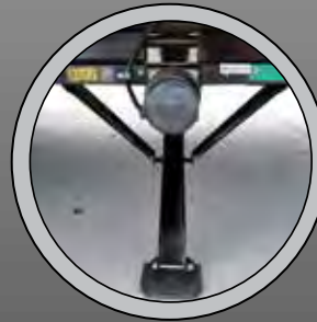
ELECTRIC STABILIZER JACKS (N/A BREEZE)