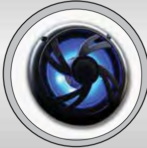
BLUE LED LIT OUTDOOR SPEAKER