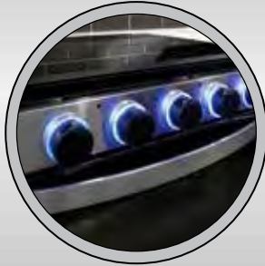
GLASS TOP STOVE WITH LED LIGHTING