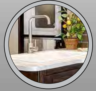
RESIDENTIAL SEAMLESS COUNTERTOPS