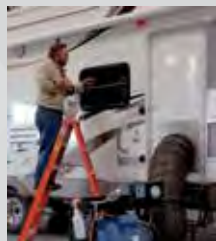
Seal Tech Air Pressure Test