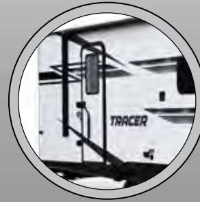
FRICTION HINGE ENTRY DOOR