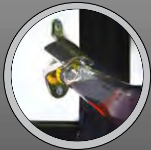
EXTERIOR BOTTLE OPENER