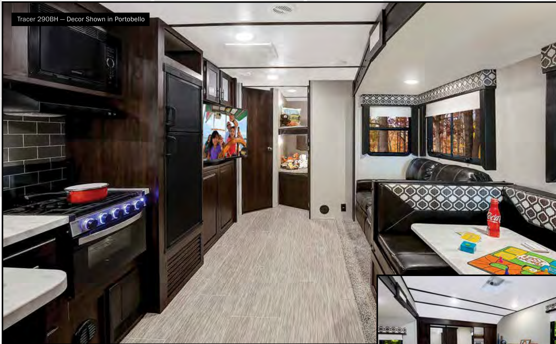
Tracer 290BH — Decor Shown in Portobello

For the consumer who is looking for ultra-light weights but doesn't want to sacrifice style, amenities, and comfort . . . we've designed the Tracer series travel trailers.