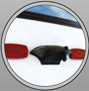
BACK UP CAMERA PREP