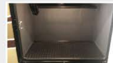
GALVANIZED STEEL STORAGE COMPARTMENT WITH RUBBER STORAGE PROTECTION FOR YOUR PERSONAL ITEMS

All sidewalls, floors and slide pieces are vacuum bond laminated and constructed with high strength low alloy steel. We surround every opening with HSLA. HSLA is a type of alloy steel with low carbon content which provides superior mechanical properties and resistance to corrosion.