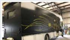
SHERWIN WILLIAMS RV SPECIFIC PRIMER, PAINT AND CLEAR COAT NO FLAKING OR DRIPPING