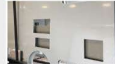
TALON GEL COAT GLASS FUSED FIBERGLASS WITH COMPOSITE BACKER