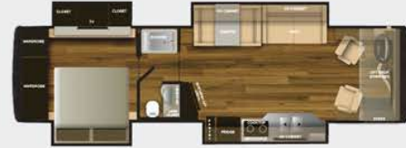
EVOQUE 35E | SLEEPS 6