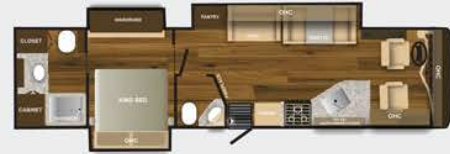
EVOQUE 37E | SLEEPS 8