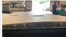
ONE PIECE WRAPPED FIBERGLASS ROOF NO SEAMS FROM FASTENERS OR RADII