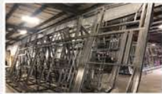
HSLA - HIGH STRENGTH LOW ALLOY STEEL 72% STRONGER THAN ALUMINUM