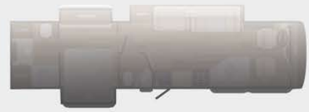
EVOQUE 35EB | COMING SOON