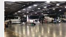
FULL CAMPING SIMULATION YOUR UNIT IS WORKING BEFORE THE DEALER RECEIVES IT