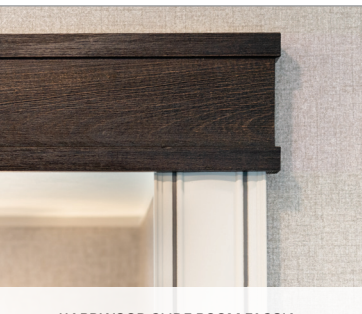
HARDWOOD SLIDE ROOM FASCIA