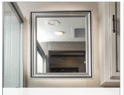
INDUSTRY EXCLUSIVE LED BACKLIT MIRROR