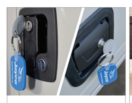
KEYED-ALIKE LOCK SYSTEM