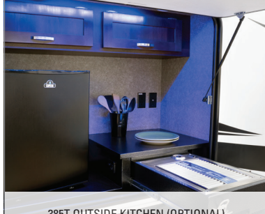
385T OUTSIDE KITCHEN (OPTIONAL)