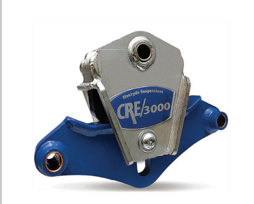
MORRYDE CRE3000 RUBBERIZED SUSPENSION