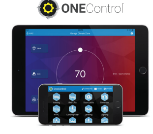
OPTIONAL AUTO-LEVELING UPGRADE FEATURES WI-FI REMOTE CONTROL VIA APP