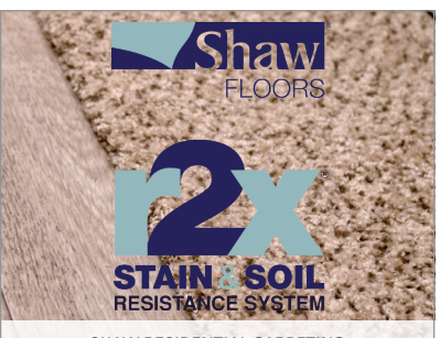
SHAW RESIDENTIAL CARPETING WITH R2X STAIN GUARD