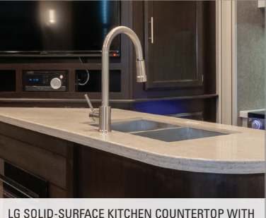
BAMBOO SINK COVER AND STRAINER

JAYCO'S EXCLUSIVE JAYSMART™ LIGHTING SYSTEM