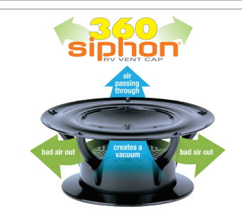
360 SIPHON ROOF VENT