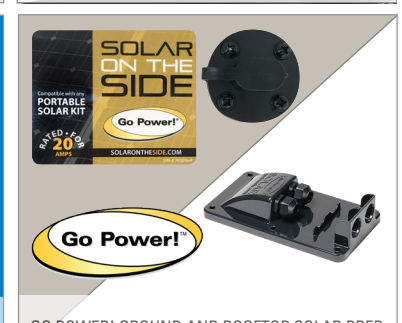
GO POWER! GROUND AND ROOFTOP SOLAR PREP