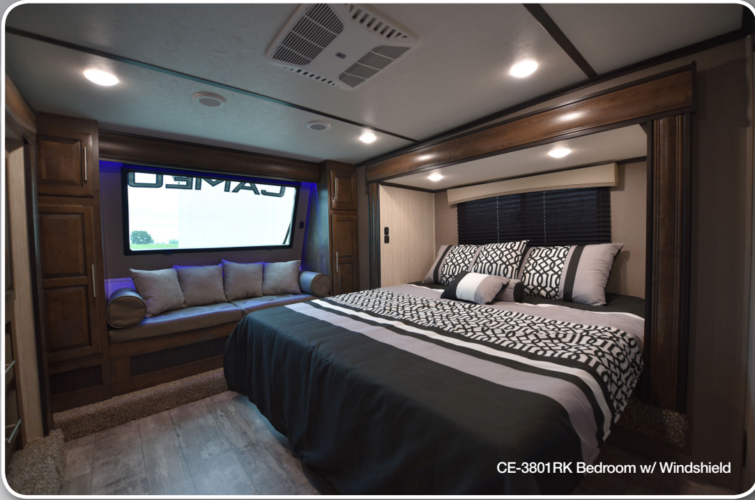
CE-3801RK Bedroom w/ Windshield