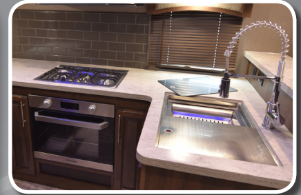
Gourmet Kitchen includes Stainless Steel Appliances, & a Pullout Faucet