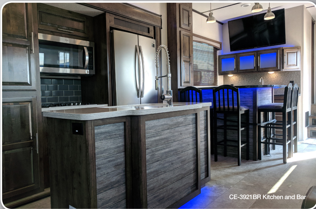
CE-3921BR Kitchen and Bar