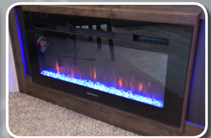
Dual Flat Front 5,300BTU Fireplaces