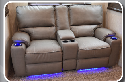
5 Function Tru-Sit Thomas Payne Massage Theatre Seating & Cup Holders