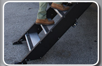
Step Above Entry Steps

Cameo brings you twice the fun! Two TV's, two Fireplaces, two 15K A/C Units, two Awnings and much more, come standard with every Cameo. Stainless Steel Gourmet Kitchens and solid surface countertops make you feel right at home, while the Thomas Payne Theater Seats and the King size mattress provide next level comfort. New LED Accent lights throughout provide ambient lighting for every situation. The blue accented exterior, generator prep, and new Step Above entry steps help each Cameo stand out from the crowd. Take your camping experience to the next level with Cameo.