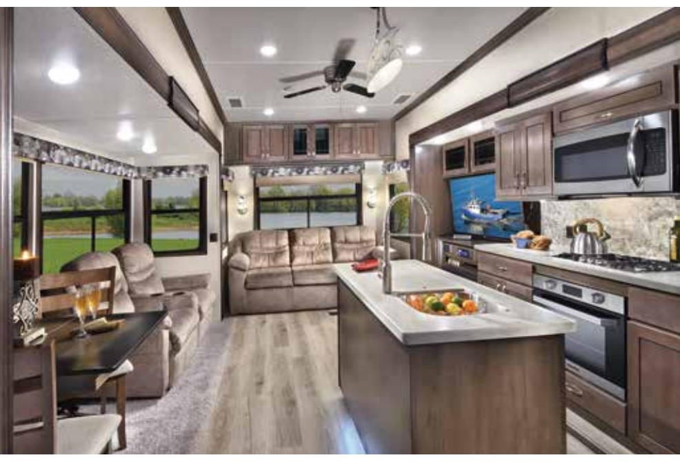
The popular 31lk rear living room offers plenty of open living space for family and friends. The Franklin™ hide-a-bed sofa converts to an additional sleeping area for quests. Large landscape view windows let in plenty of light and fresh air.

Travel without leaving behind the comforts and conveniences of home with Silverback extended stay fifth wheels. Spacious floorplans, name brand appliances, residential furniture with lifetime warranties, and solid construction provides the safety and security experienced RV enthusiasts expect from Cedar Creek. Wherever the road leads, whether full-timing or weekending, Silverback enhances peace of mind for life's great adventures.