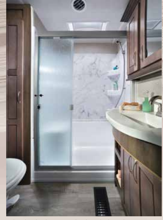
Silverback's luxurious bath includes a large 48" shower with seat and glass doors, porcelain toilet, and a Create-a-Breeze fan.