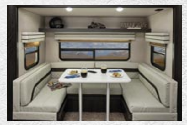
This impressive sofa/dinette is standard in the 29HFS and 30HDS models.