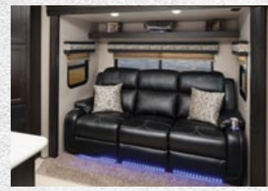
A three-recliner sofa with heat, massage and blue LED lighting is an available option on the 29HFS and 30HDS.