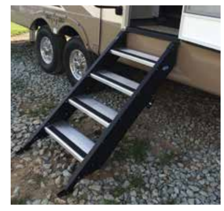
MorRyde "Step Above®" 5 tier entry step provides secure footing as you enter our extra wide 32" entry door.