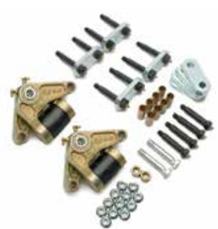
Dexter® E-Z Flex® Suspension Standard