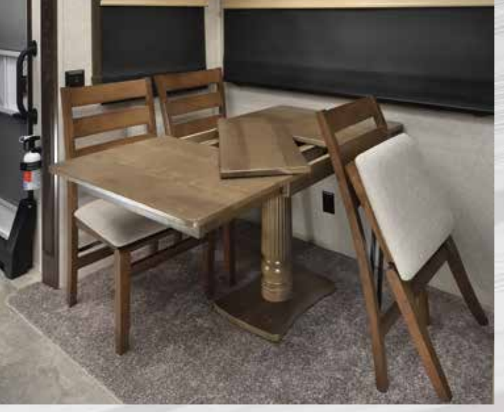
Our freestanding table comes standard with a large leaf extension and four chairs, (two with hidden storage and two fold-away).