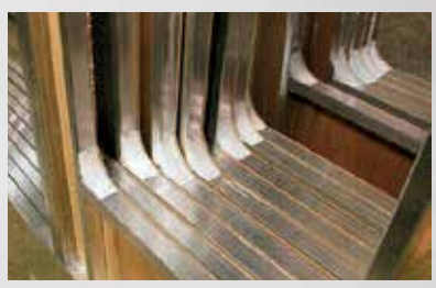
Aluminum window frames.