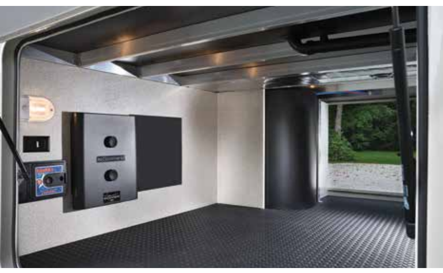
Hathaway's Z-frame, heated front storage compartment provides over 100 cu. ft. of storage and includes an extra vacuum port for outside clean-ups.