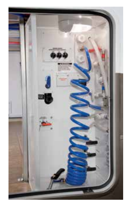
The Docking Station includes outside shower, black tank flush, water bypass, 12V battery disconnect, selector switches, dump valves, water tank and city fills for centralized convenience.