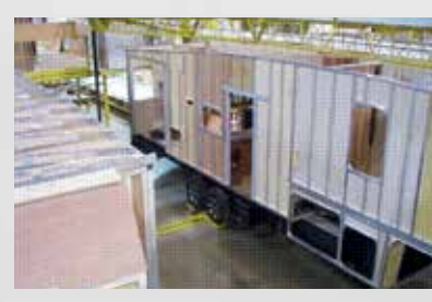
Cedar Creek's famous residential All-aluminum Super-structure (Roof, sidewalls, and floor) on 16" centers or less.