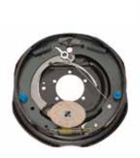
Dexter® Nev-R-Adjust® Brakes Standard