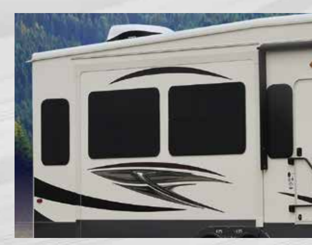
True High Gloss Classic fiberglass gelcoat exteriors and end walls. Truly the best of the best in fiberglass. Accept no imitations.