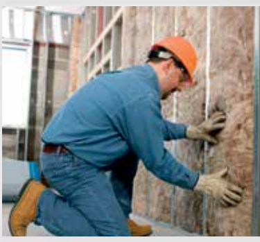
Residential Glasswool Insulation, designed by nature.

Compare acceleration forces experienced by an axle and trailer while traveling over railroad tracks at 30 MPH. The E-Z Flex® System provides up to an 80% reduction in forces on the trailer frame vs. a standard equalizer. E-Z Flex® significantly outperforms all other competitors in the same road test for a smoother, more protective ride for your trailer and cargo.