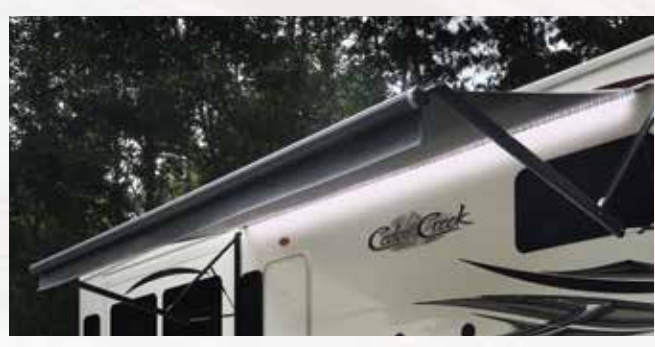
A&E awning with LED night light strip.