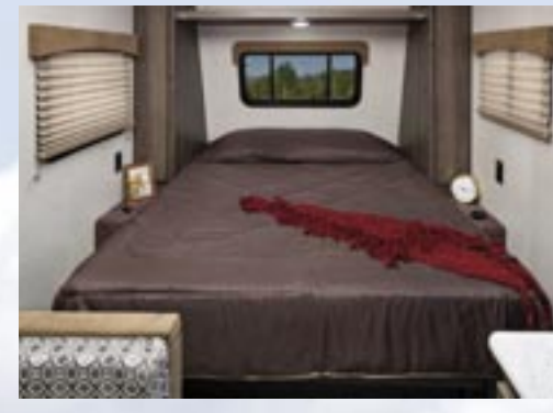
The optional Murphy bed optimizes your living space and provides a comfortable seating area.