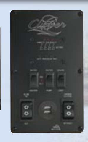
Interior Command Center controls awning, interior lighting, slide out, water heater/pump, battery indicator lights and has two USB outlets.