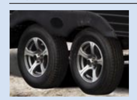
Tandem axles enhance stability