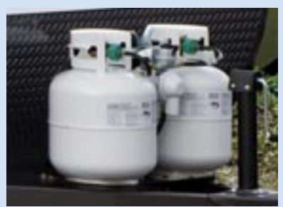
Double 20 lb. LP tanks