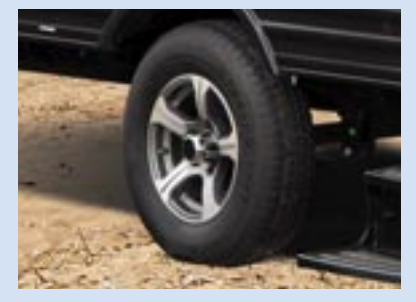
Standard radial tires. (Deluxe Package shown with upgraded aluminum wheels)