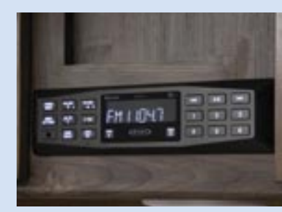
Jensen AM/FM/Bluetooth stereo with app control includes Interior/Exterior speakers