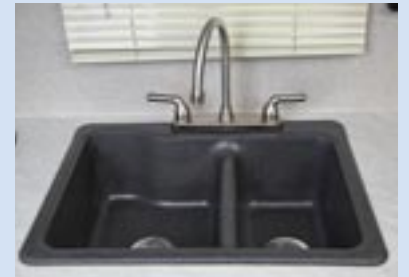
Deep, double bowl Stonecast sink with high neck faucet