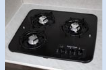
3 Burner range with Piezo ignitor