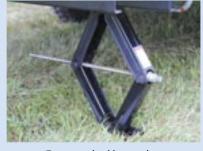
Four standard heavy duty stabilizing jacks