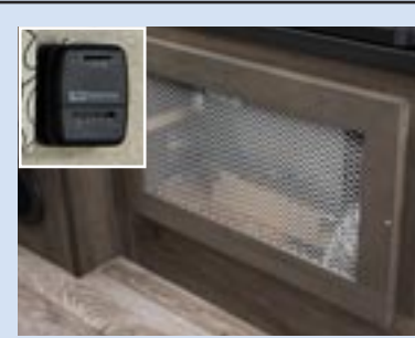
20,000 BTU Ducted furnace