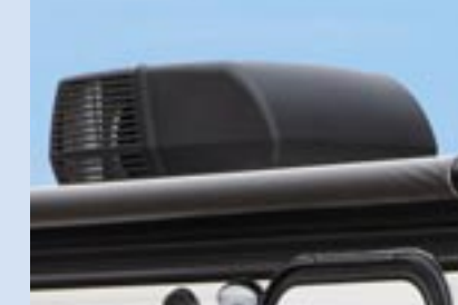
13.500 BTU air conditioner