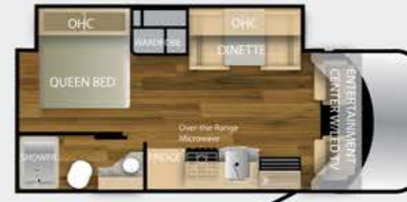
VIPER 25V | SLEEPS 3-4