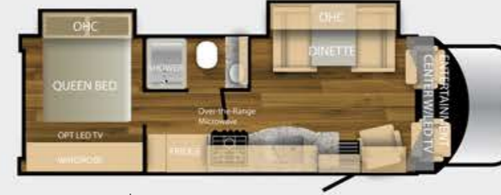
VIPER 27V | SLEEPS 3-4