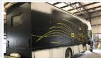
SHERWIN WILLIAMS RV SPECIFIC PRIMER, PAINT AND CLEAR COAT NO FLAKING OR DRIPPING