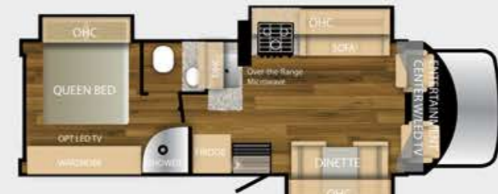
VIPER 29V | SLEEPS 5-6