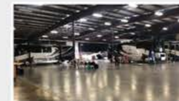
FULL CAMPING SIMULATION YOUR UNIT IS WORKING BEFORE THE DEALER RECEIVES IT